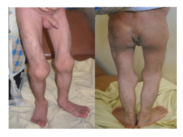
Figure 3 Generalized lipoatrophy, muscular hypertrophy, hypertrichosis, and large joints.