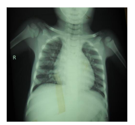
Figure 6 Cardiomegaly in X-ray chest.