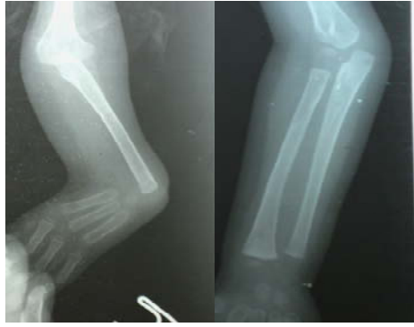
Fig. 4: Plain Xray shows right ulna with malalignment, absent radius, one carpal bone (Versus 3 on left side), 3 metacarpal bones, absent thumb and rudimentary index finger phalanges.

Plain X ray of vertebrae showed hemivertebrae and fusion of cervical and dorsal vertebrae with supernumerary ribs and fusion on the right side. Right upper limb showed absent head of humerus, deformed humerus and ulna with malalignment of ulna, absent radius, one carpal bone (Versus 3 on left side), 3 metacarpal bones, absent thumb and rudimentary index finger phalanges, Figure(4).