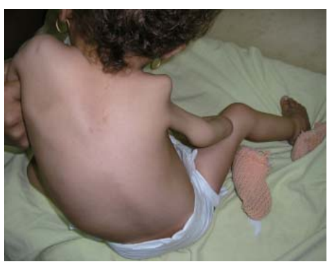
Fig. 2: MURCS association with scoliosis, low hair line, elevation of left shoulder blade and hemangioma over back.