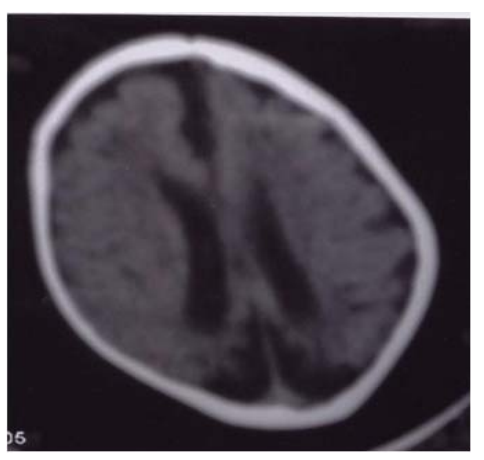
Fig. 1D: CT brain showing bilateral posterior encephalomalacia with atrophic changes.

Computed tomography brain scan (Figure. 1D) revealed bilateral posterior encephalomalacia with atrophic changes and EEG sleep record showed left fronto-central epileptiform discharges. Echocardiography revealed small patent foramen ovale hemodynamically insignificant in addition to a tiny patent ductus arteriosus. Trivial tricuspid regurge with pulmonary artery pressure 18mmHg was discovered by Doppler study.