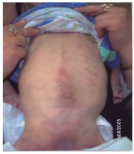
Fig. 1C: Scleroderma like areas.

Laboratory investigations: Mild hypochromic anemia with anisocytosis, leucocytosis and marked thrombocytopenia. Bleeding and clotting times were within normal. ESR and CRP were both elevated. Normal liver and kidney function tests. Normal blood ammonia level. Low serum albumin (2.8 gm/dl) and total proteins (4.7 gm/dl). Normal blood and urinary aminograms.