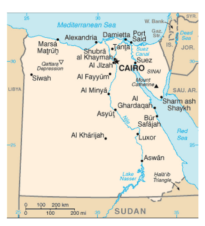
Figure 1 Map of Egypt.

burden to families and society [8]. Children with major congenital malformations (CMs) were more likely to have Bayler Mental Development Index Scores of ≤70, Psychomotor Developmental Index Scores ≤70, neurodevelopmental impairment, moderate – to – severe cerebral palsy, length in the ≤10th percentile, head circumference in ≤10th, more rehospitalization and higher rate of early intervention use at 18-22 months corrected age [9]. The causes of congenital malformations are divided into four broad categories, genetics, environmental, multifactorial and unknown. A genetic cause is considered to be responsible in as many as 10-30% of all birth defects, environmental factors in 5-10%, multifactorial inheritance in 20-35% and unknown causes were responsible for 30-45% of cases [9]. Most of the CMs therefore are thought to have a multifactorial inheritance resulting from interactions between genes and environmental factors which are mostly unknown, such diseases are called complex diseases. This interplay between genes and environmental factors underlie the etiological heterogeneity of these defects and study of gene-environmental interactions will lead to better understanding of the biological mechanisms and pathological processes that contribute to the development of complex birth defects. It is only through this understanding that more efficient measures will be developed to prevent these severe costly and often deadly defects [10].