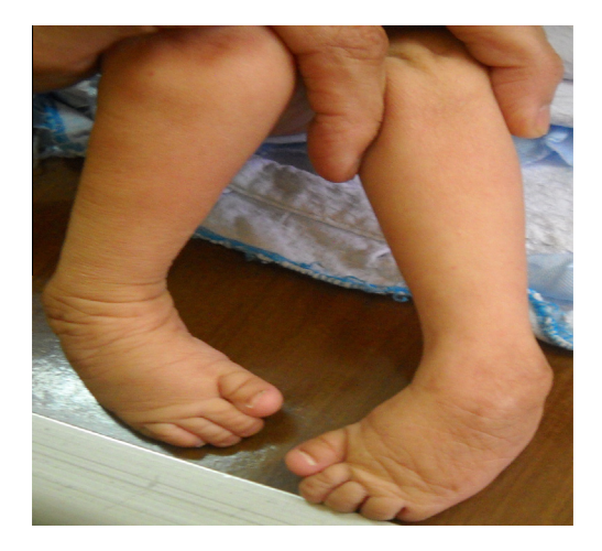
Figure 4 Bilateral talipes equinovarus deformity.