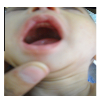
Figure 2 High arched palate.

Abdomino-pelvic ultrasonography and ECHO cardiography were normal. Extended metabolic screen, serum lactate,