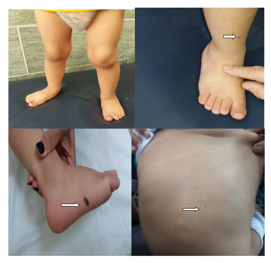
Figure 5 Dysplastic nails, overlapping of the second toes over third toes, short second toe of the left foot, pigmented nevus on the back, lateral side of the right foot and front of the right leg.

Otologic problems, particularly recurrent otitis media, were common in KMS which were not detected in our patient [20].