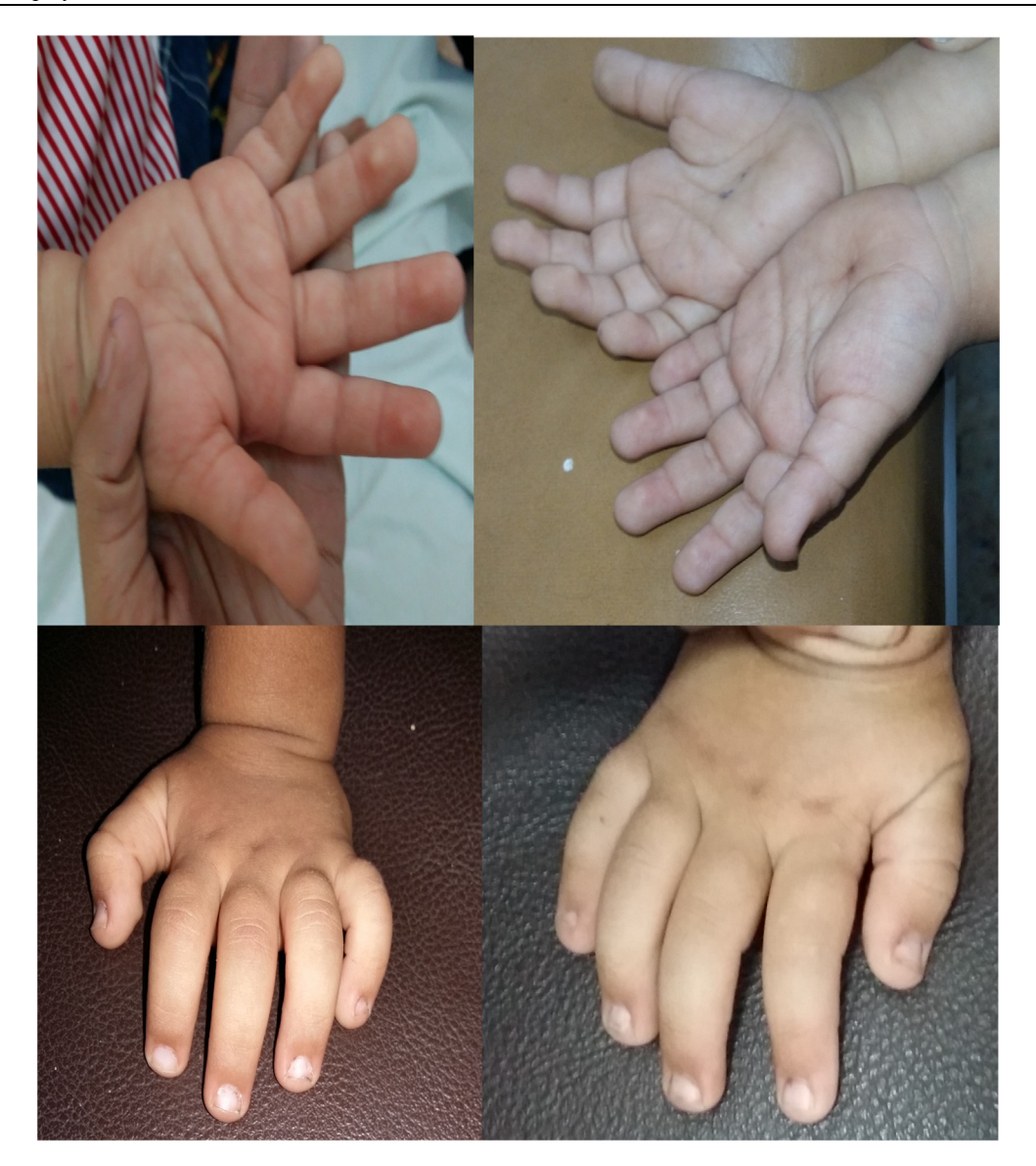
Figure 3 Persistent fingertip pads and dysplastic nails.

scan revealed normal function of the right kidney and no function of the left kidney. Urinalysis and kidney function tests were normal.