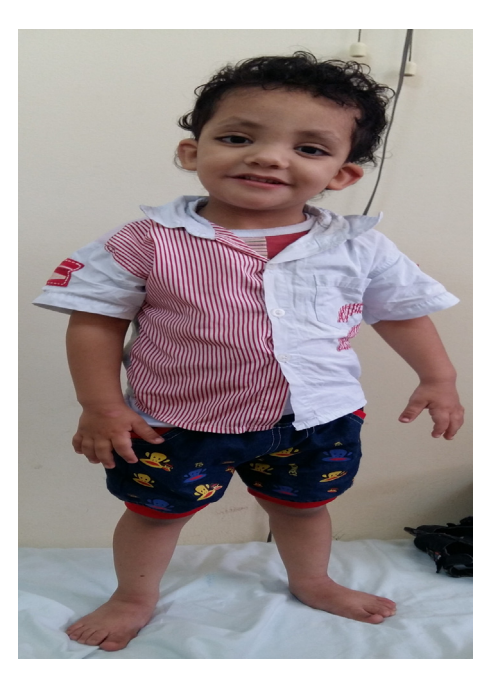
Figure 1 Photo of the patient.