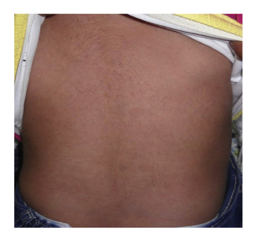
Figure 3 Hypertrichosis over the back.