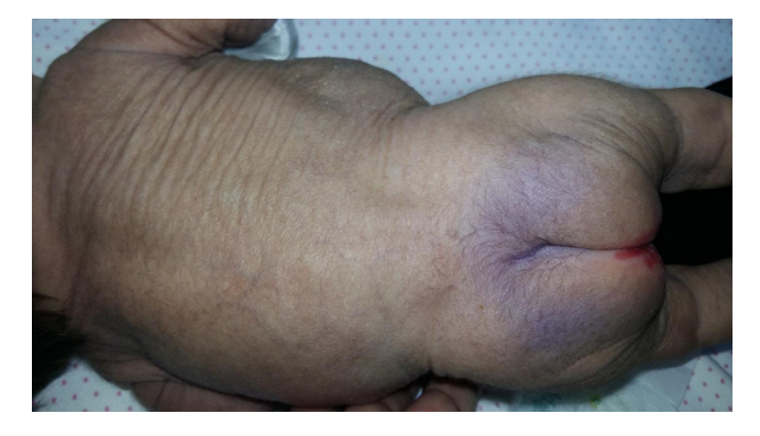
Fig. 3. Mild hypertrichosis over lower back and buttocks with thin wrinkled skin and loss of subcutaneous fat.

neck. They suffer from short vertebrae, elongated clavicles, bent femora, hip displacement, corpus callosum agenesis and microcephaly [8]. MOPD II often has additional problems as squeaky voice, microdontia, widely spaced primary teeth, poor sleep patterns especially in early years, normal or near normal mental