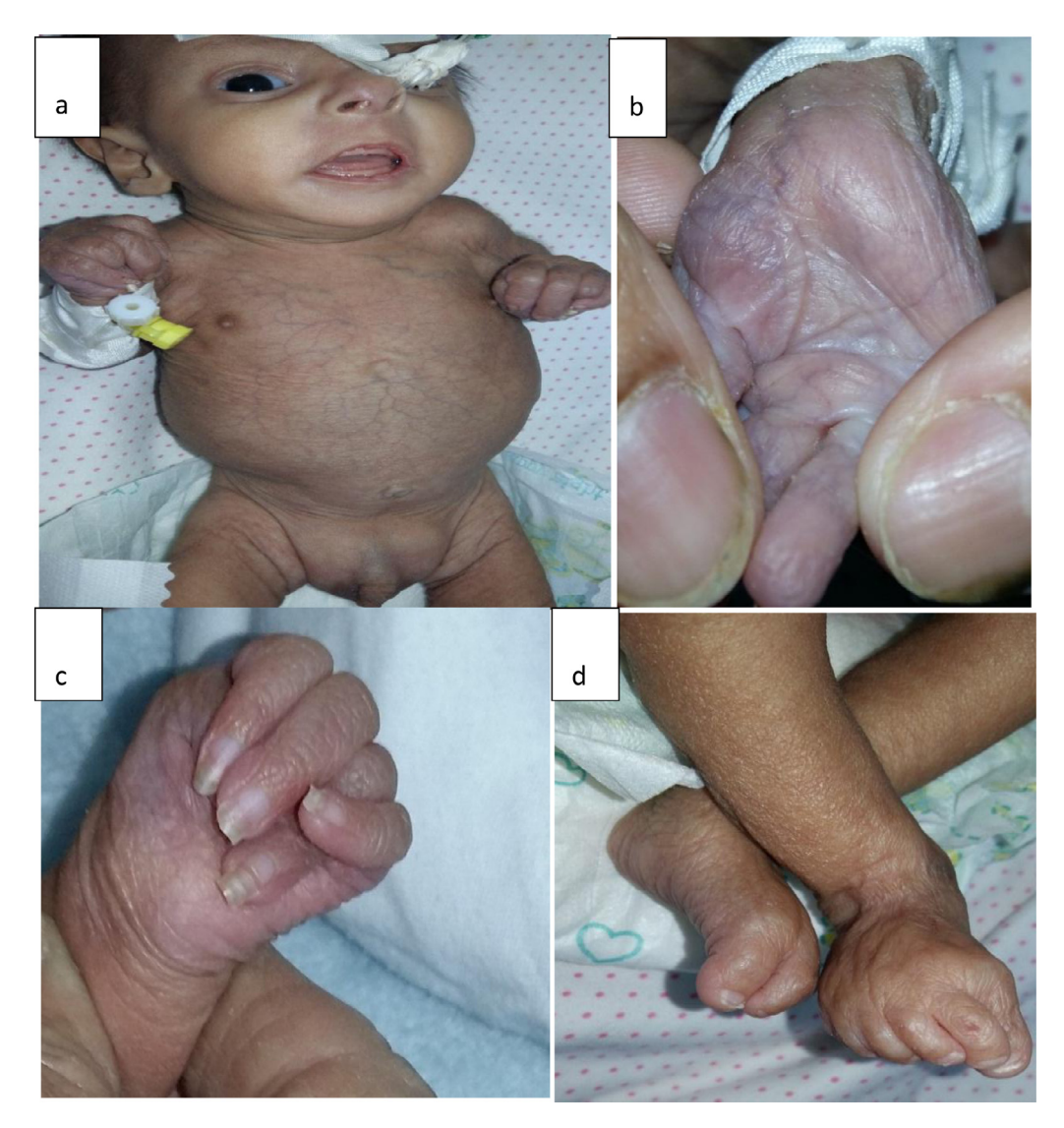
Fig. 2. a) Prominent superficial veins over chest and abdomen b) Groove between thumb and palm of hand c) Arachnodactyly and clenched fist d) Thin dry skin over both legs and deviated toes.