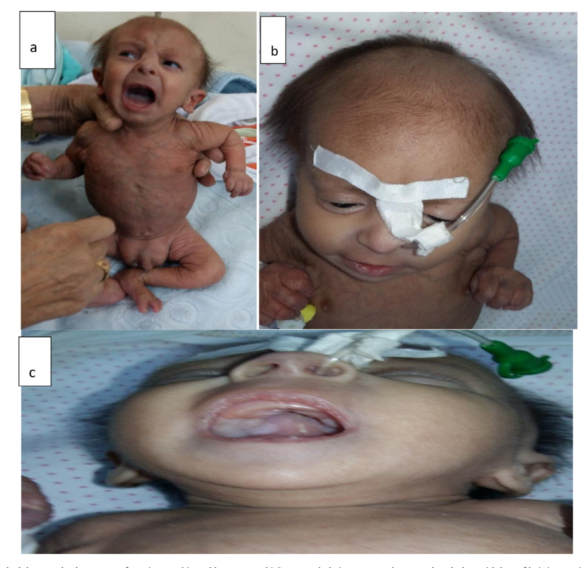
Fig. 1. a) Marked decreased subcutaneous fat, micrognathia and low set ears b) Sparse scalp hair, sparse eyebrows and eyelashes with loss of hair in anterior two thirds of scalp c) High arched palate and short neck.

Microcephalic osteodysplastic primordial dwarfism (MOPD) has three subtypes I, II, III. Although MOPD I and III were originally described as two separate entities on the basis of radiological criteria mainly in long bones and pelvic bones, later reports confirmed that the two forms represent different expression of the same syndrome. MOPD I commonly has hair thinness in scalp, eyelashes and eyebrows, protruding eyes, prominent nose with a flat nasal bridge, small low-set ears, micrognathia, small chin and short