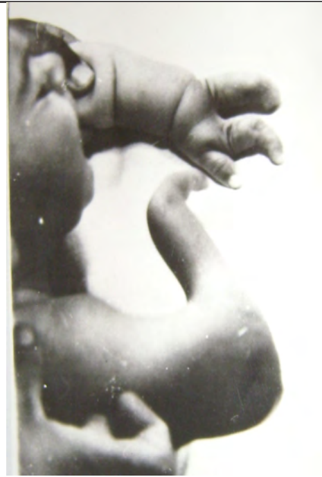
Fig. 8: Monodactyly of right hand and macrodactyly and split left hand.