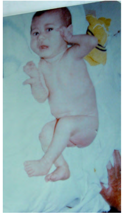
Fig. 6: Teratogenic bilateral split hand deformity.