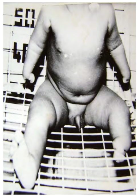
Fig. 7: Teratogenic Bilateral acheiria, left sided apodia and ectrodactyly of right feet.