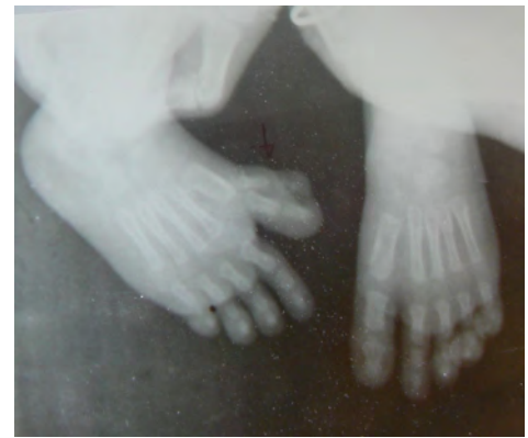
Fig. 2: Klipple Feil syndrome.