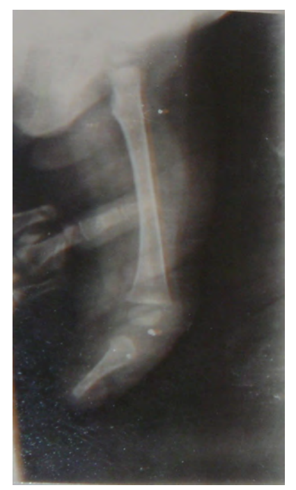
Fig. 5: Teratogenic left sided apodia, absent fibula and short tibia.