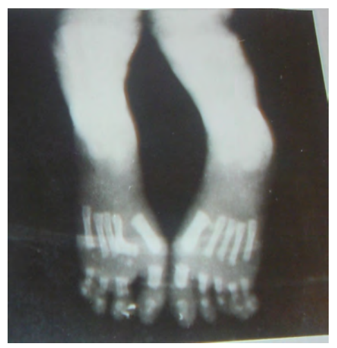
Fig. 14: Extra transverse metatarsal and polysyndactyly of right 2<sup>nd</sup> toe in OFD syndrome.