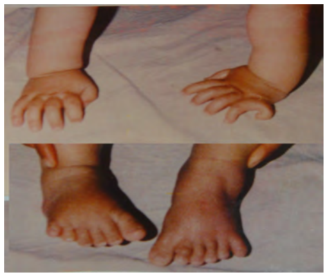
Fig. 1: Laurence Moon syndrome.