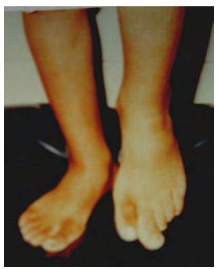
Fig. 13: Macrodactyly of left 2<sup>nd</sup> toe.