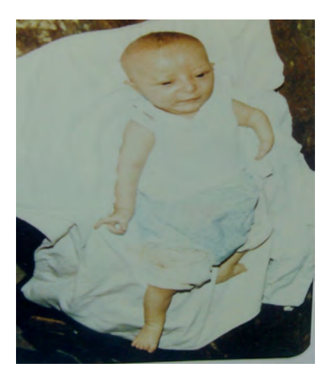
Fig. 19: Monodactyly of lt. hand and ectrodactyly of rt. hand in Hand- Heart syndrome type I.

twenty four (24) cases constituting about (43.6%) of cases with isolated limb defects have clear and valid histories of maternal drug intake during the first trimester. Most catastrophic is prescription of progesterone preparations