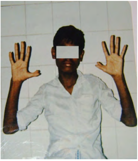
Fig. 12: Bilateral bifid thumbs in Fanconi syndrome.