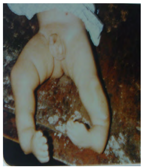
Fig. 16: Teratogenic hand-like-foot anomaly (Ambroise Pare like malformation).