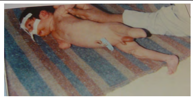
Fig. 11: Right acheiria and left apodia in Hanhart syndrome.