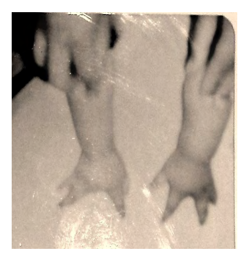
Fig. 18: Teratogenic split hand deformity and ectrodactyly.