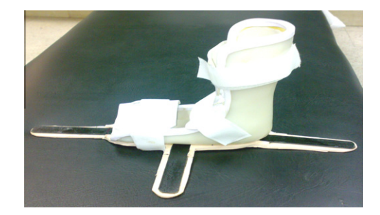
Figure 2 Single three side support ankle–foot orthosis.

2.3.1.1. Spasticity evaluation. Modified ashworth scale was used [15]. The degree of spasticity was evaluated by passive movement for both limbs while the child was completely relaxed, lying supine on a mat with the head in mid position.