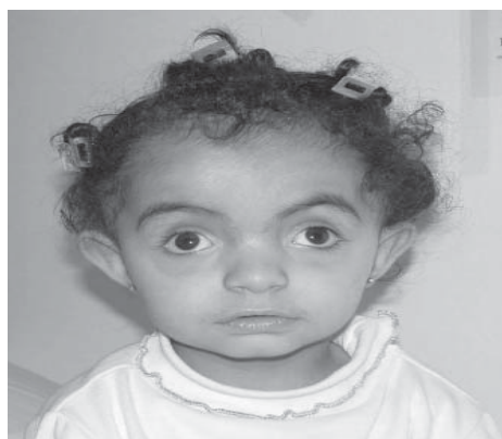
Fig. 3a: Characteristic facial features of inversion duplication of chromosome 8p as shown in patient 5.

The proband was a Kuwaiti girl, the only born child to healthy, non-consanguineous parents, mother being 23 and father 28 years old. Family history revealed presence of a maternal brother, sister and an uncle with a congenital eye disorder of an unclarified type. She was delivered following an uneventful pregnancy at full term, by caesarian section because of prolonged labour and foetal distress. She weighed 2750g. She was referred to the genetics clinic at age of 15 months for assessment of her developmental delay. She had a length of 69cm (<5 th centile), a weight of 8kg (<5 th centile), and OFC of 45cm (<5 th centile). On physical examination dysmorphism was noted. It included hypertelorism, downward slanting of palpebral fissures, broad nasal bridge, strabismus, curved eye brows, thin lips with flat philtrum, high arched palate, a small benign haemangioma behind right ear lobe and short neck (Figure 3A and Figure 3B). She also showed mild muscular hypotonia, umbilical hernia and deep planter creases.