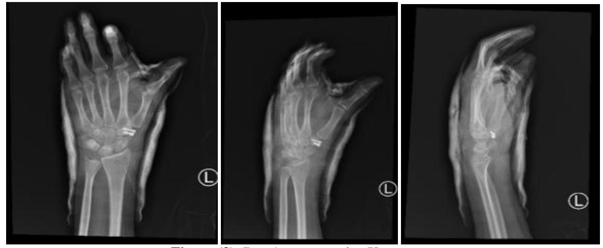
Figure (3): Day 1 postoperative X-ray.