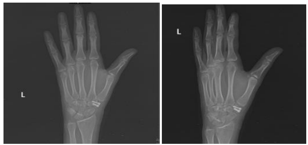
Figure (4): 2 weeks postoperative X-ray.