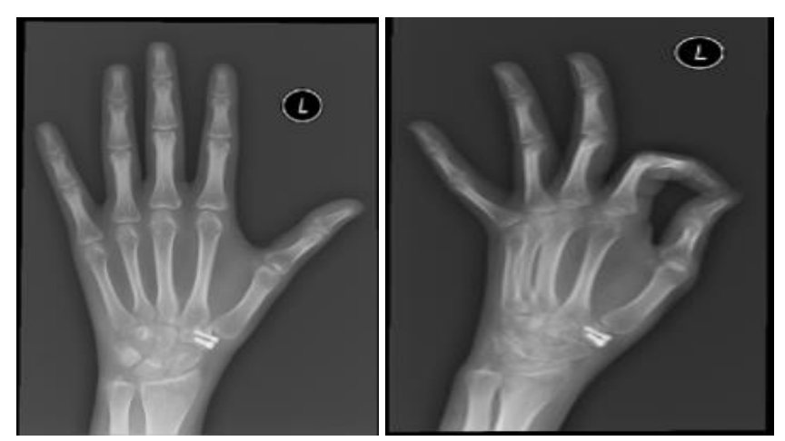
Figure (6): 3 months postoperative X-ray.