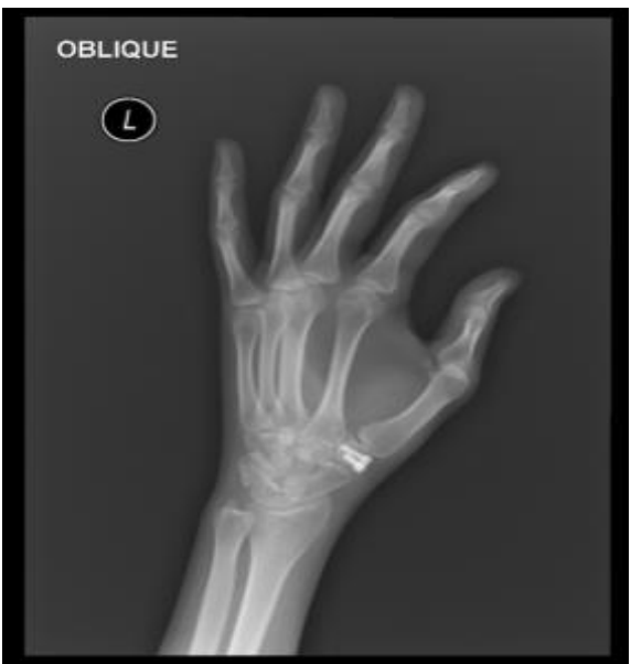
Figure (6): 1.5 year postoperative X-ray.