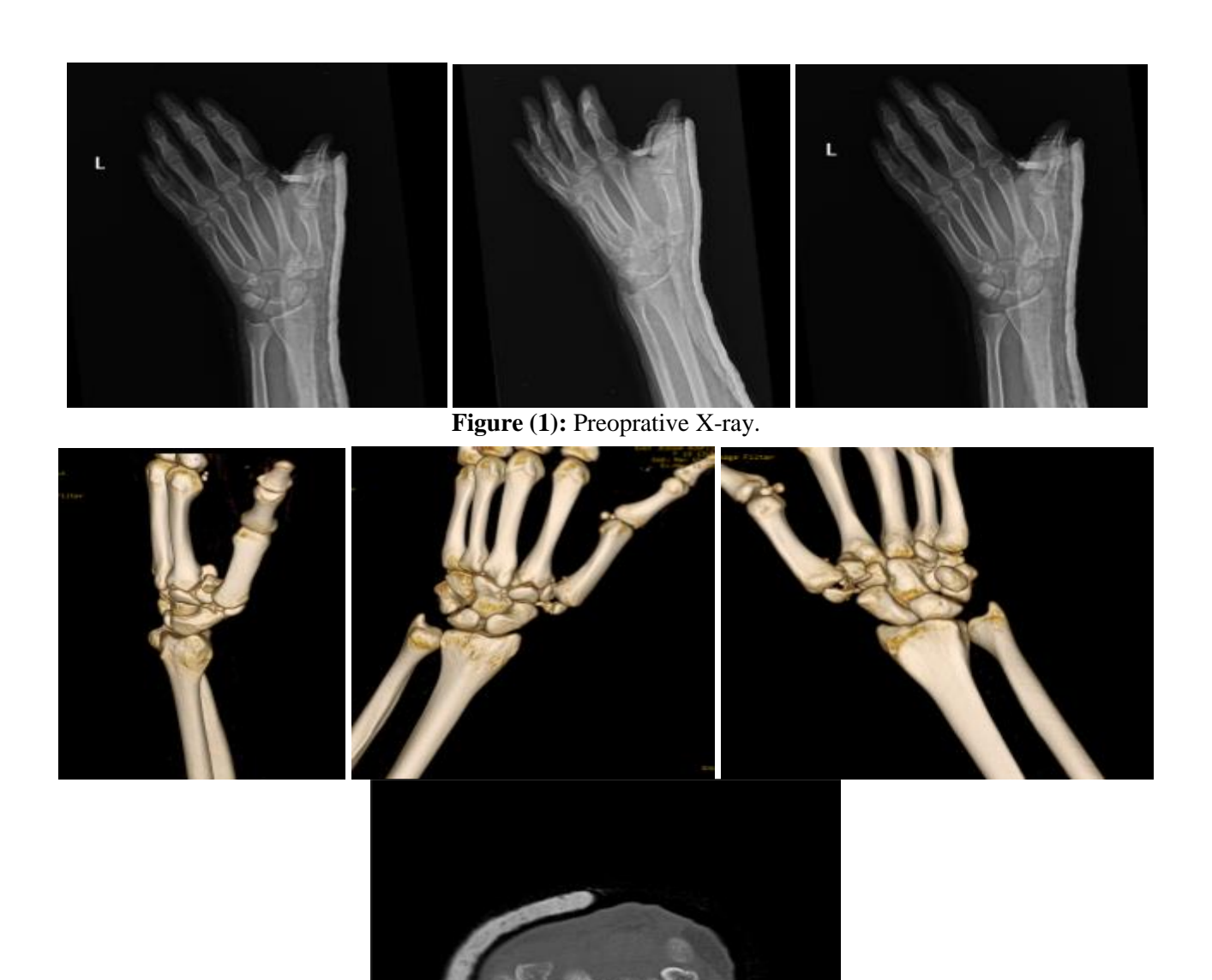
Figure (2): Preoperative CT.