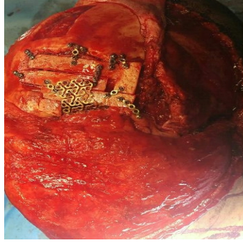
Figure 5 : Intra-operative, site graft harvest (A) reconstracted defect (B)

(Figure 5). The residual defect at superior orbital rim was covered with titanium mesh. The postoperative result was satisfactory (Figure 6).