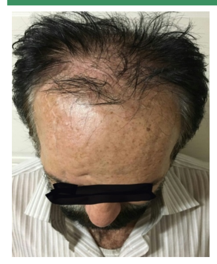
Figure 3 : Post-operative appearance after 6 month, bird view

Case 2 : A 20-year old man was referred to Emergency Department of Sina Hospital as a case of multiple traumas due to road traffic accident.. The patient was transferred to operating room where all loose fragments of fractured frontal bone was removed via the laceration on forehead area. Atter two and half month, he presented to our clinic with a cosmetic deformity of forehead on left side (4nA and B). He was a candidate for reconstruction of frontal deformity, treatment of ZMC fracture and orbital wall reconstruction.