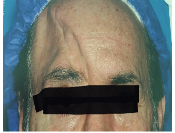
Figure 1: Pre-operative forontal view of patient

Case 1 : A 52-year old male patient present to outpatient department with the compliant of deformity at frontal region. He had a history of head trauma before seven years in which he sustained a depressed communited fracture of frontal bone on his right side.. Now, he present with cosmetic deformity of fore head (Figure 1), and he claimed that he could not get job because of this deformity. He did not have known past medical history.. The defect was reconstructed with split calvarial graft and titanium mesh.