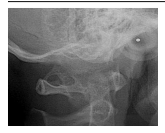
Fig.4: Cropped image of a lateral cephalogram showing complete ponticulus posticus