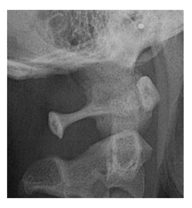
Fig. 2: Cropped image of a normal lateral cephalogram

The varied appearance of ponticulus posticus in our study as seen on lateral cephalogram is shown in Figure II-IV (cropped images of lateral cephalograms).