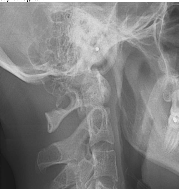
Fig.3: Cropped image of a lateral cephalogram showing partial ponticulus posticus