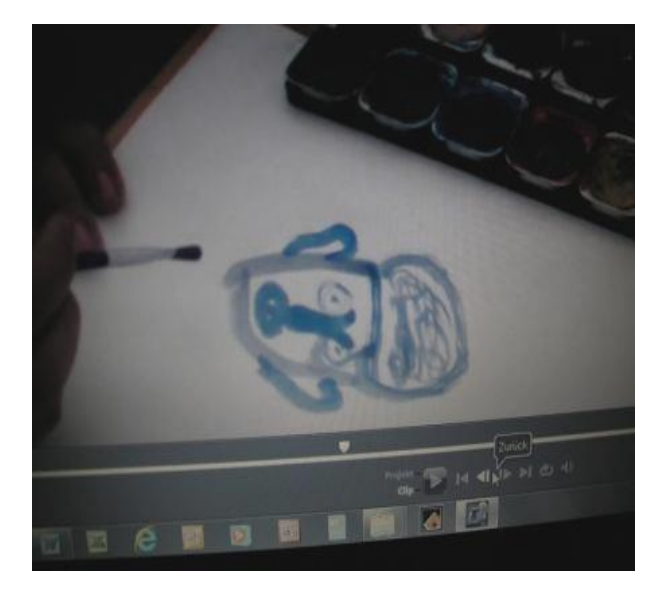
Figure 3: Painting skills

An attempt was made to offer painting material to her as to other patients. She was able to draw nice scenery using different colors and to paint precisely a face (Figure 3). Later on, she was able to make pearls from paper by wrapping colored paper around a stick of wood. It was proved that she was faster than all other patients. She could make a necklace for herself and she provided a lot of paper pearls to other patients.