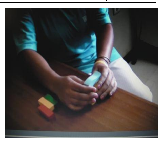
Figure 1: Reproducing shape of blocks

A neurological examination was performed. The patient was cooperative. She could perfectly understand all tasks necessary to do a full neurological examination.