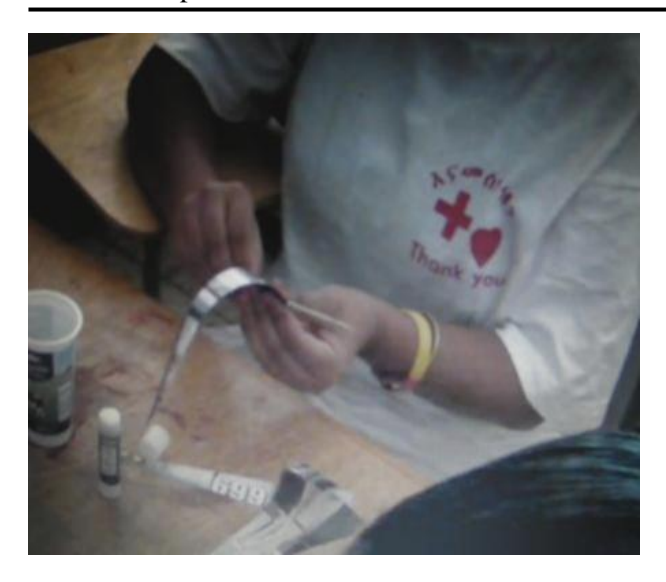
Figure 4: Making paper pearls

The patient presented herself as an insecure person. She said that she could not see what she was doing. She frequently controlled her performance and was finally successful. There was a discrepancy between her attitude of an insecure, dependent blind person while reproducing shapes of blocks and the elaborate