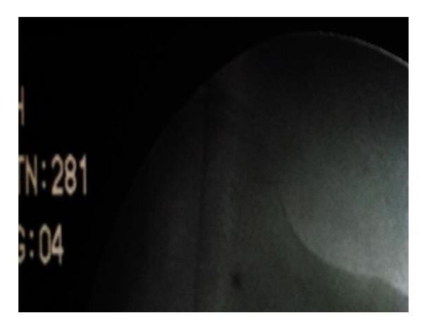
Figure 4 : Intra-operative lateral radiograph showing the k-wire placed in the lesion opening the cavity