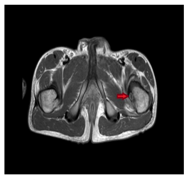
Figure 2 : T1 weighted axial MR image showing a hypointense nidus surrounded by a zone of hyperintensity and bone oedema

confirming the diagnosis histologically prior to it. Thus, the patient underwent a curettage procedure, which was done through a lateral approach. Under image guidance, a 2 mm k-wire was directed towards the osteolytic lesion over which a 5 mm cannulated drill was passed and the cavitary lesion was opened (Figure 4). The track in the outer femoral cortex was widened, and a curette was passed through the tract into the lesion, and the lesion was curetted out and the tissue obtained was sent for histopathology and microbial culture. The histopathology revealed granulation tissue with both acute and chronic inflammatory cells with areas of dead bony tissue, and the culture grew Staphylococcus aureus. These findings led to the final diagnosis of brodie's abscess in contrast to our provisional diagnosis, which was based on clinical examination and radiological features, emphasizing the importance of culture and histology of every suspected bony neoplasm. The patient was managed with antibiotics based on the sensitivity, and he was allowed only partial weight bearing with support for the next 6 weeks. At 6 months' followup, the patient was asymptomatic and could do all the activities which were restricted previously. A MRI scan was repeated at 6 months followup, which did not show any signs of persistent disease.