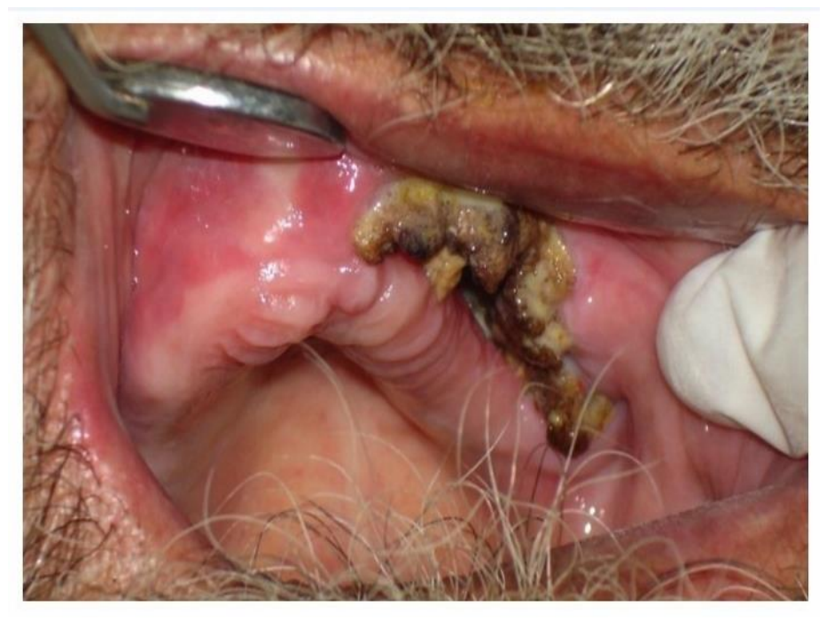
Figure 2 : Intra- oral photograph showing necrosis of mucosa and underlying bone in relation to canine to tuberosity area of left vestibular region of maxilla along with abnormal communication b/w vestibule and palate.