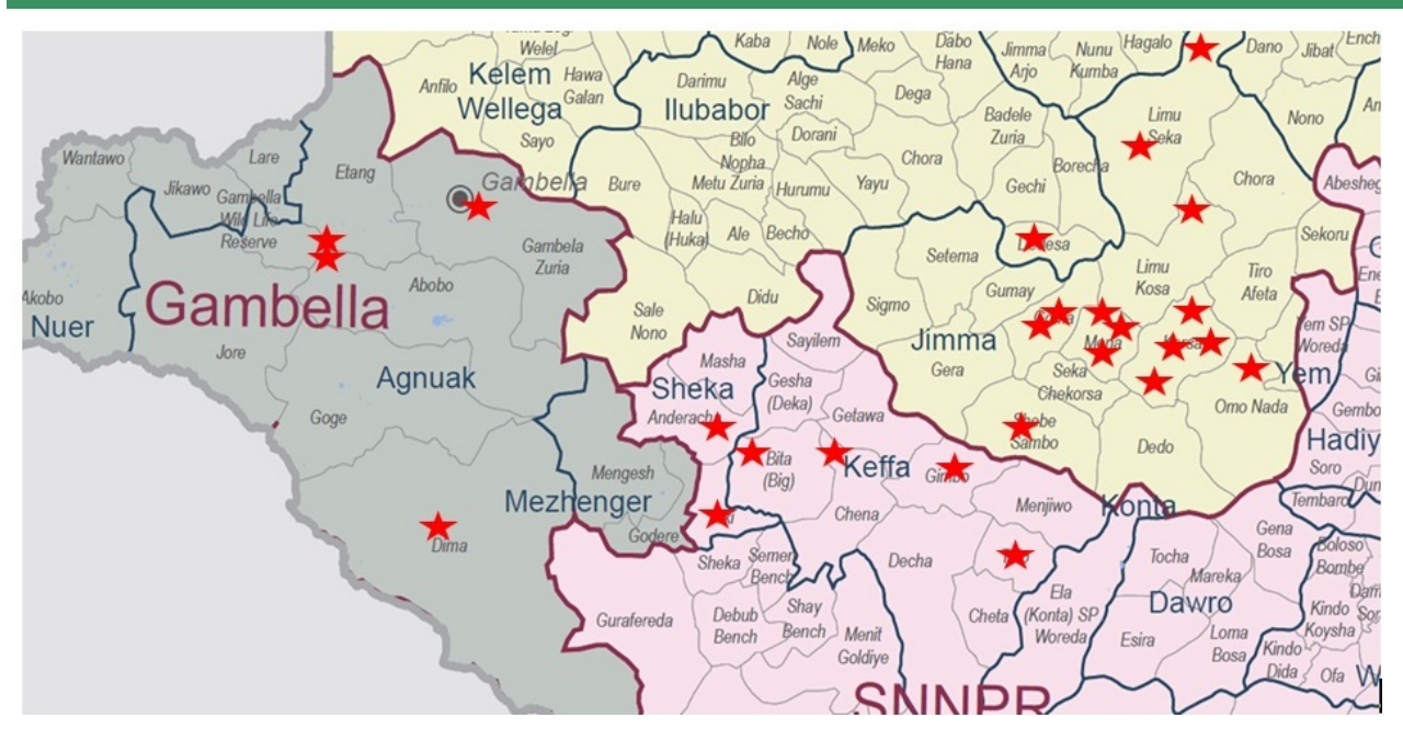
Figure 1 : Map of Southwest Ethiopia region illustrating the origin of patients who presented to Jimma University Hospital with pancytopenia

Similarly, there is no clear seasonal variation seen even though the number of cases was found to be higher between December and March (Figure 2). This is most likely due to selection bias; data was collected retrospectively for patients presenting