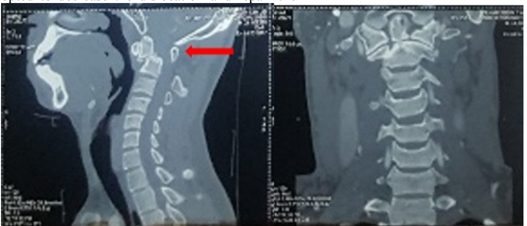
Figure 2 : Sagittal-coronal planes CT scan of the cervical spine showed fracture at the axis (C2), specifically at the odontoid process, categorized as type II, based on Anderson and D'Alonzo classification (arrows).

C1-C2 joint, before placing the patient in a prone position, to perform the posterior approach. This process was completed by fixing four pedicle screws into the joint line articular processes, followed by bone graft fusion to the space (Figure 3).