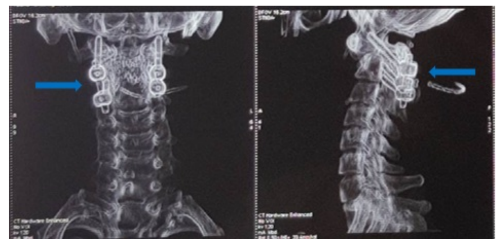
Figure 4 : CT-scan postoperative of the cervical spine coronal-sagittal showed the reduction of C1-C2 joint.

Follow-up up to 12 months after surgery, based on clinical evaluation, the patient was stable, as the X-rays did not recognize any fixation failures or secondary displacement. Despite the stiff fixation system, the patient experienced no major functional challenges, and the dynamic X-ray showed adequate fixation. Our patients were disease-free, had full range of motion, and no neck pain felt.