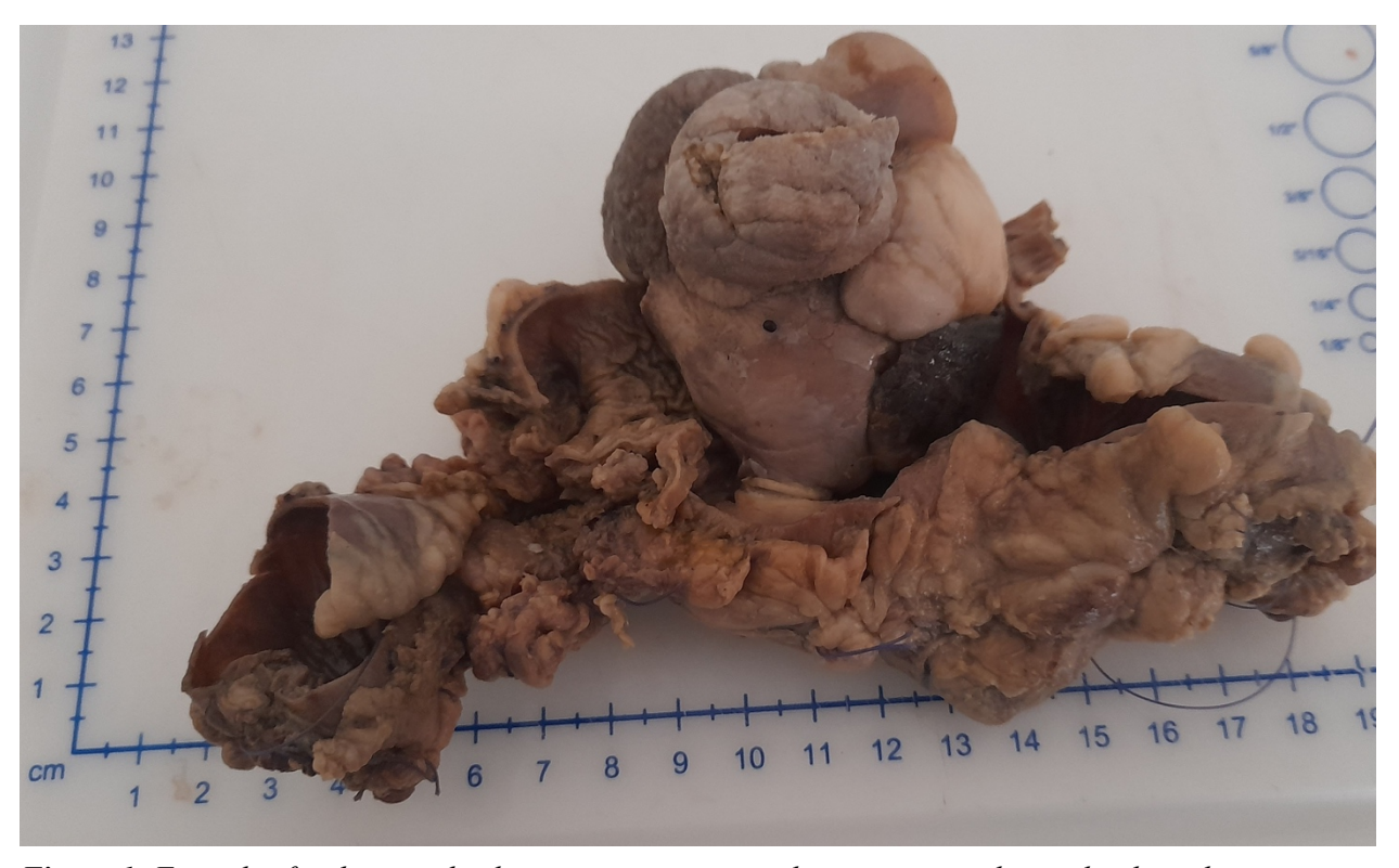
Figure 1: Formalin-fixed sigmoid colon resection segment showing an intraluminal polypoid teratoma

Macroscopic analysis of the resected intestine showed a segment measuring 17cm in length. On opening, there was a lobulated pedunculated polypoid mass protruding into the lumen. The mass measured 7 x 6 x 5 cm and its cut surface was entirely solid. The stalk was slender, measured 0.6cm in diameter and traversed the tunics of the colon to the exterior (Figure 1).