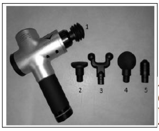
Figure 2. The handheld massage device (Hypervolt) with the different attachment heads which can be used. For this study was used head 4.