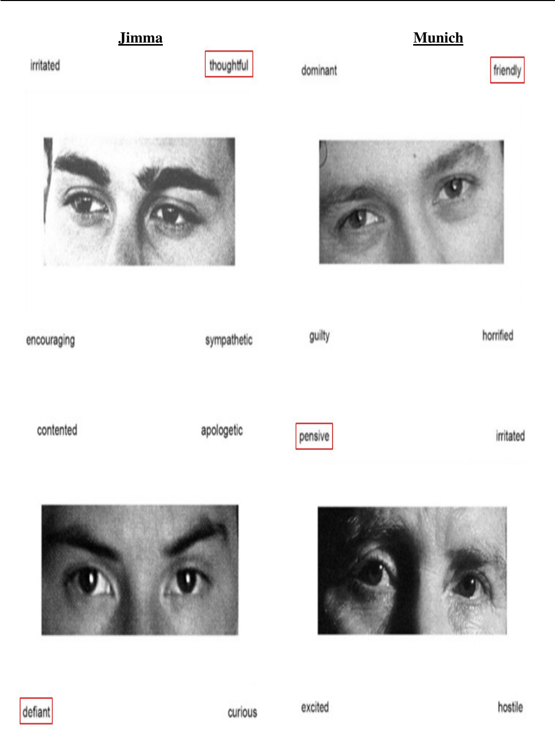
Figure 2: Emotions identified correctly most and least often by first-year medical students in Jimma and Munich in the Reading the Mind in the Eyes test

Within the universities, we found a moderate, positive correlation between the BEES scores and performance in the RME-R test, i.e. between emotional and cognitive empathy. This