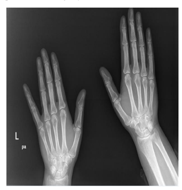
Figure 1: Images of erosion in PIF joints