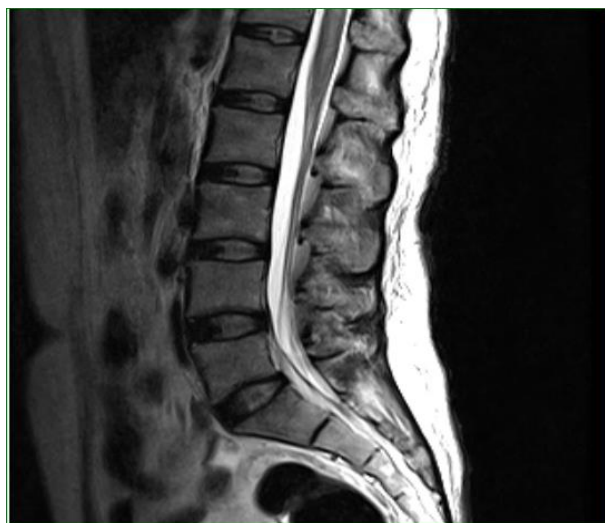
Figure 1: MRI image of lumbar spine tuberculosis myelitis

Antituberculosis and intravenous corticosteroids treatment was started. Seven weeks from the onset, on-control spinal MRI myelomalacia was determined, and there was no leptomeningeal enhancement. After six weeks of rehabilitation, lower limb total motor score was increased from 0/50 to 15/50.