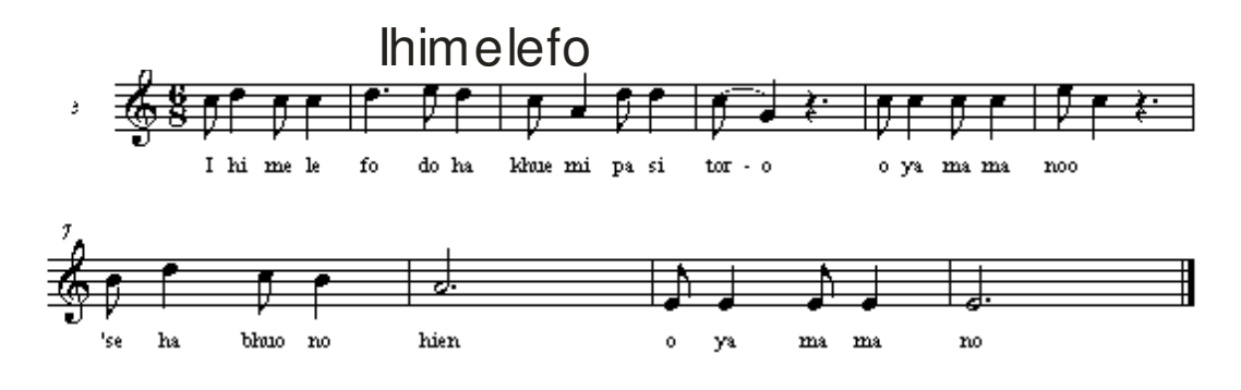
Text In Esan I hime le fo 'do ha khue mi pasitor Oya mamanoo