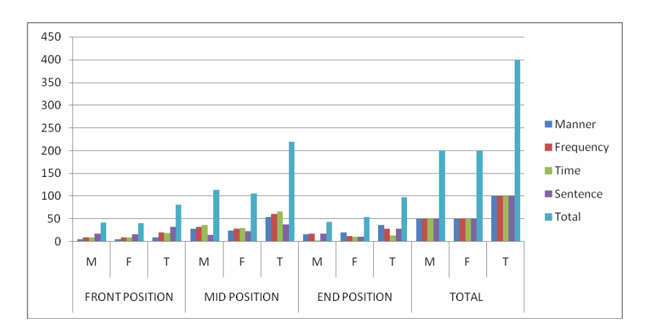
Fig 1: A Histogram showing students' placement of adverbials

the result. The X-axis has the percentages at intervals of 10 per cent and ranges from zero (0) to sixty 60. The positions are placed on the Y-axis.