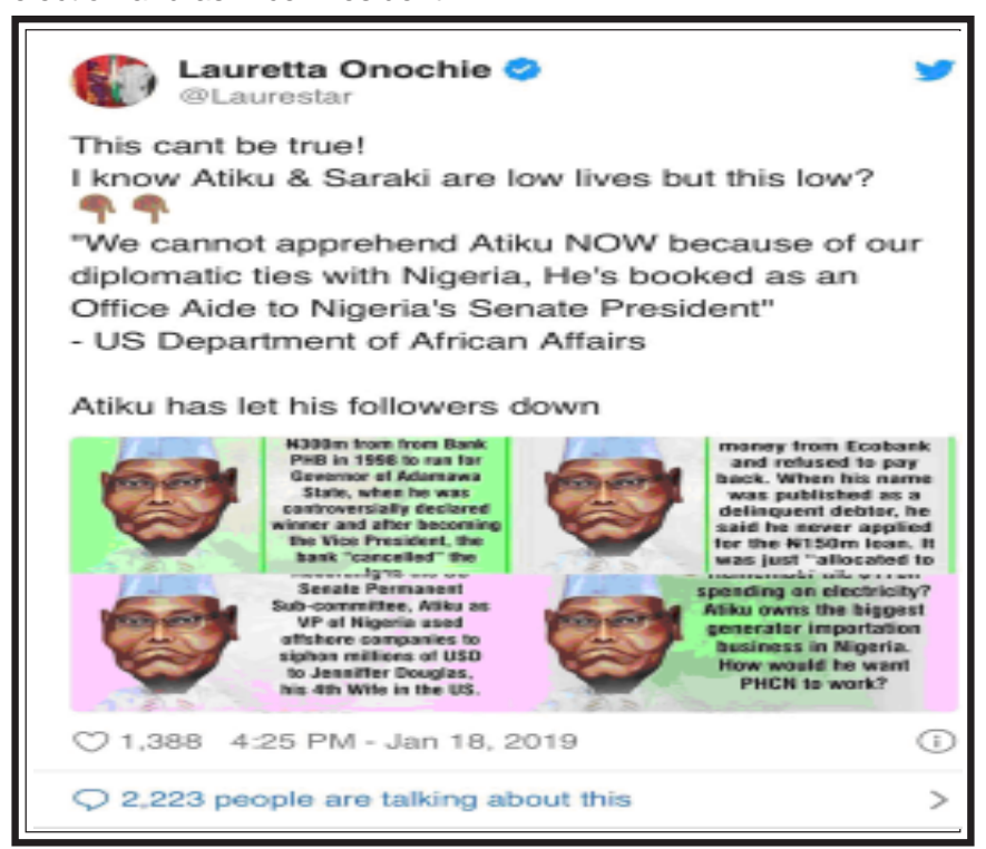
Figure 8: Allegations against Atiku

Lauretta Onochie, a social media aide to President Buhari used her Twitter account to make untrue allegations against Atiku Abubakar. In the post, she referred to Atiku and former Senate President Saraki as "low lives". She also claimed that the US Department of African Affairs said that Atiku was not arrested on his USA visit because of their diplomatic ties with Nigeria and the fact that Atiku was booked as an office aide to Saraki (Figure 8). Onochie added images alleging that Atiku refused to pay back a N150 million loan obtained from Ecobank, took N300 million from Bank PHB in 1998 to fund his governorship election and as Vice President.