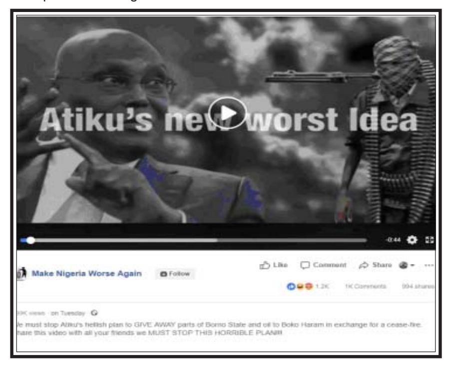
Figure 7: Atiku made ceasefire deal with Boko Haram

A 44 seconds long video posted on Facebook by "Make Nigeria Worse Again" claims that Atiku Abubakar made a ceasefire plan with Boko Haram insurgents. The video claims that the deal would give Boko Haram some land and autonomy in the North eastern state of Borno, and oil fields in exchange for a ceasefire. Captioned "We must stop Atiku's hellish plan to GIVE AWAY parts of Borno state and oil to Boko Haram in exchange for a cease-fire", the video was posted on January 8, 2019. It shows Atiku and a Boko Haram member (Figure 7) with inscription indicating "Atiku's new worst idea".