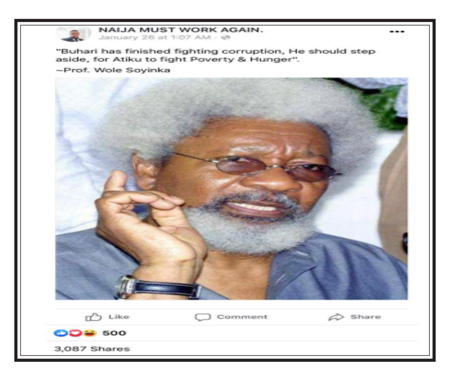
Figure 1: Buhari should vacate for Abubakar

The post was liked by 500 users, shared 3087 times and commented on 1365 times. However, CrossCheck Nigeria has written that the information is false and wrongly attributed to Soyinka.