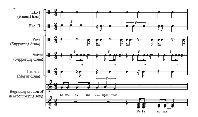
Example 2: An opening phrase of an adevu vocal and instrumental music.

Law'adamezoakplefe o! A wild beast never walks on its claws.