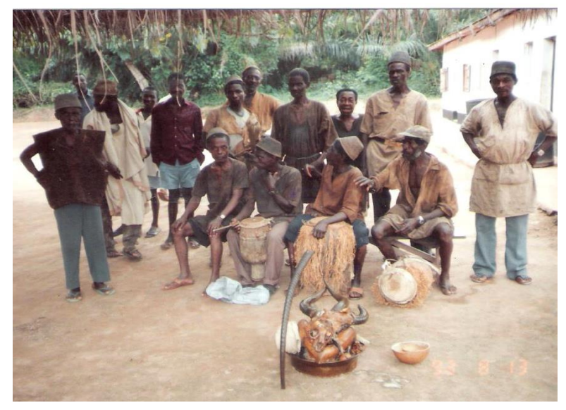
Fig. 2: Visual art objects: adegba (huntersø deity; old animal head in a brass pan) and ladzo

bad news such as death. It is, therefore, not surprising to see hunters clad in red clothing materials tied around their heads, necks, elbows or wrists or suspended on their hunting costumes/implements. The red colour also communicates deepseated feelings of hunters to outsiders as a way of reinforcing the meaning of what they express verbally to listeners in their songs. Although these red pieces of cloth do not in any way add to the form, structure or quality of the songs sung; their impact on dirges sung or on the occasion, symbolise the (grieving) condition of the mourners as not a pleasurable one. The picture below shows a group of hunters who have worn or displayed some of these art objects.