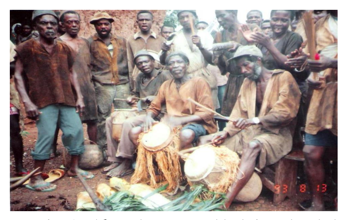
Fig. 1: Adevu dance ensemble being played during an initiation ceremony of a hunter.

The picture below is a group of adevu performers in the northern Ewe traditional area of Alavanyo.