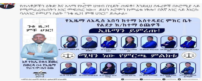
Figure 5: Enemification during the 2021 Election

Figure 3, which are found to be photo-shopped, with added captions in Amharic which is translated as 'Register! The clear robbery of the Oromuma has been evident to all concerned. Since its establishment, Nech-sar National Park in Gamo Zone in southern Ethiopia, tourism...' In the post, the source accuses the Oromos as if they seized the land of Southern Nations, Nationalities and People's Region (SNNPR). The source of the post put a wrong caption to an Oromo politician standing in Borena National Park as if the site is in Nech-Sar National Park, which is managed by the SNNPR. This picture also reminds us that hate speech is partly achieved through disinformation by twisting realities. The Amharic caption, which is added by the one who edited the original photo, reads 'not only the Earth, the sky is also ours' which implies having insatiable desire to grab everything they come across. Figure 4, on the other hand, is an instance of accusation against ethnic Amhara by portraying them as people grabbing/invading Oromos' land in the name of establishing churches and calls on ethnic Oromos to be cautious of what he labeled as 'the invading Amharas'. In addition, Figure 5 below which illustrates how targets are portrayed as potential land grabbers is captioned, 'Our adversary's intention is to systematically eradicate ethnic Oromos and give the land to the settlers. They called the technique of evicting the indigenous Oromos and replacing by the invaders 'alerting citizen.'