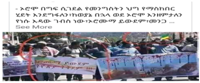
Figure 6: Interpretation in Hate Speech

There is also role of interpretation in which a hate speech is extrapolated as call for measure. In Figure 6, for example, demonstrators are seen holding a banner which reads 'let Oromuma<sup>60</sup> be destroyed', to which an apparently ethnic Oromo social media user assigned additional meaning beyond what is visible in the banner. This seems part of the art of fueling hatred by evoking stronger emotions.