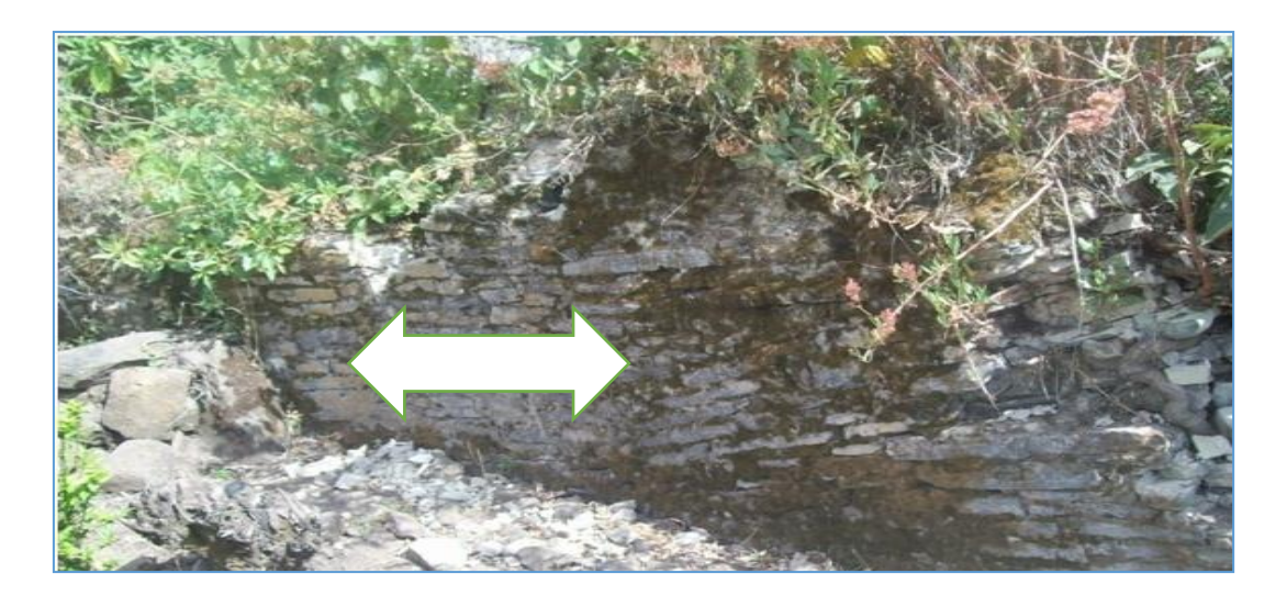
Figure 3: The ruins of the building where the foundry was established at Mähal Wänz.

Generally, the gunpowder manufacturing industry and the workshop at Mähal Wänz show that the kingdom of Šäwa was making significant technological progress in the first half of the nineteenth century. Thus, it is evident that craft technology reached its zenith and created a new pre-industrial dynamism in the technological history of Ethiopia in general and the kingdom of Šäwa in particular. In fact, the tradition continued by the succeeding monarchs in the second half of the nineteenth century Ethiopia.