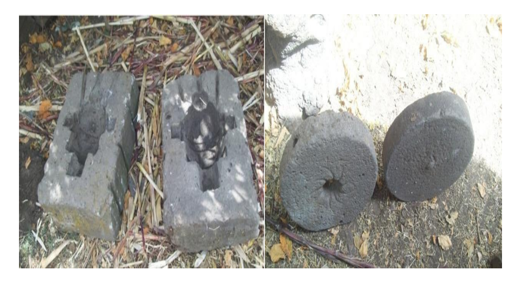
Figure 2: Moulds (left) and wheels (right) of the gunpowder foundry at Mähal Wänz.

After a lengthy process, the gunpowder was produced in the workshop and examined, each taking a distance of approximately forty yards (37 meters). It had a ball-like structure.<sup>77</sup> Here, King Śahlä Śəllase's dream to manufacture firearms was achieved. According to oral tradition, the location of the King's gunpowder industry is remembered by the name yä-barud mäwqäča or mäwqäča bet . It is now found in a district called Gaǧälo.<sup>78</sup> From our observation, some ruins and industrial spare parts are still available in the area. The material remains, such as two-shape creators (made of stone) and two wheels (made of stone and iron), are shown in Fig 2, and the ruins of the building where the foundry was located are illustrated in Fig 3.