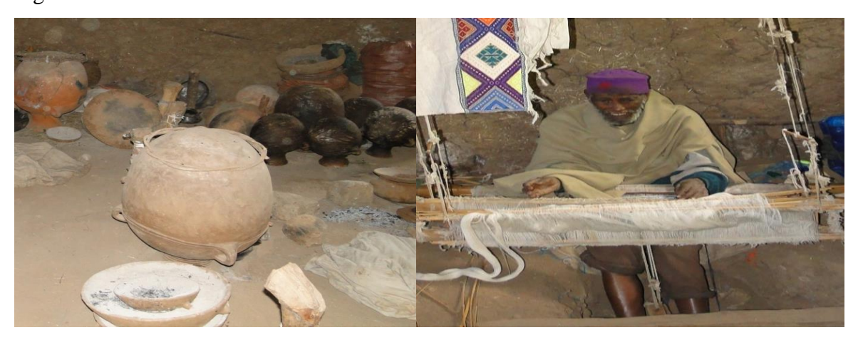
Figure 4: Pottery workshop of the monastery (left), a monk weaving (right).

Besides religious activities in the monastery, monks and nuns worked on various handicrafts (including pottery, blacksmithing, weaving, and tanning). Inside the monastery, gender division of labor was practical. Women were responsible for pottery and spinning, while men were responsible for weaving and blacksmithing.<sup>84</sup> The responsibilities of men are shown in Figure4.