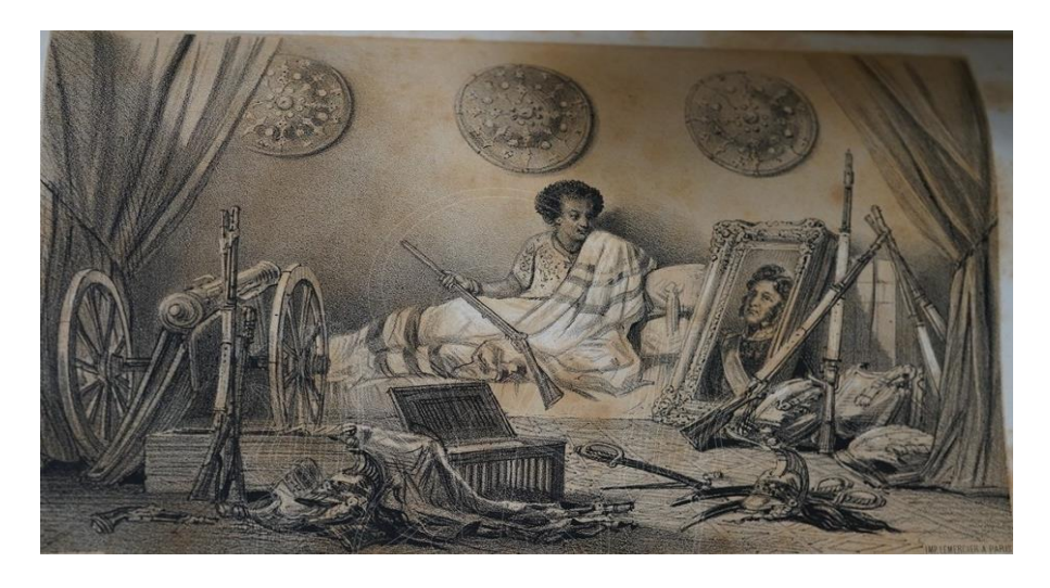
Figure 1: The image of Nəguś Śahlä Śəllase of Šäwa.

initially used at court.<sup>58</sup> Some of the objects used by the king inside the court were illustrated in Fig 1.