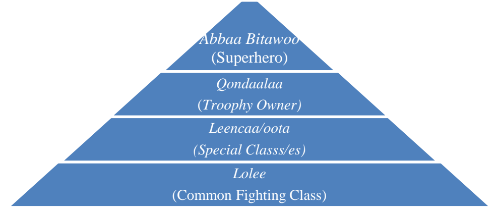
Figure 2. The Karrayyuu Military Hierarchy

Fighting is the prerogative of all males' ranging from young to old ages and this common fighting regiment is named Lolee/Lituu . The Lolees are those who confronted their enemy as a fighter. The Lolee/Lituus have no distinctions but they might contain individuals of superheroes. They are deployed and mobilized to warfare organized under Abbaa Waraanaa (commander-in-chief) who is accountable to the Abbaa Bokkuu (head of the Gadaa assembly). During the battlefront, the Abbaa Waraanaa is assisted by Jajjabii , who is acting as deputy chief of the army. Their military structure has four hierarchies such as Lolee/Lituu (common fighting), Leenca/ota Karrayyuu (the Lion/s of Karrayyuu), Qondaalaa and Abbaa Bitawoo (Figure 2).