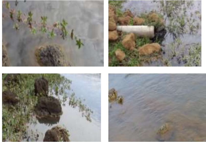
Figure 2. Sampling sites (S1, S2, S3, and S4 arranged clock-wise from left top corner) and a tube showing the discharge of the tannery effluent into the river.

A section of the river close to the tannery was considered for this particular study. Based on major land-use systems and point and non-point sources of pollution, four sampling sites were selected. Each sampling site was marked using a Geographic Positioning System (MAGELLAN GPS, 315). Sites were coded as S1, S2, S3, and S4. The first site (S1) was located upstream of the tannery effluent and the remaining three sites were below the effluent discharge (Figure 2).