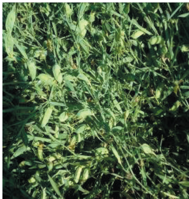
a) Treated plants (protected plots)

Means followed by the same letter are not significantly different from each other according to Tukey's HSD test ( P < 0.05 ); means were computed from 10 plants.