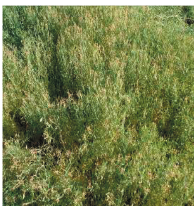
b) Damaged plants (control plots)