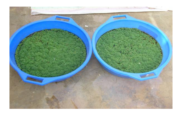
Fig. 1 . Mother culture of A. filiculoides (left) and A. microphylla (right) in the greenhouse at Adet

Both strains were well adapted to Adet in a greenhouse and outdoor in concrete tanks. The strains started multiplying within two days and covered the whole surface of the containers forming a thick mat within three weeks after inoculation (Fig. 1). The starter inocula were very small in amount and hence the multiplied strains were inoculated to other containers to achieve enough biomass for further activities (Fig. 2a).