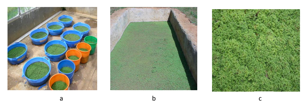
Fig. 2. Performance of A. filiculoides and A. microphylla in the greenhouse (a) and in concretetanks, (b) during June – October (c) thick mat of azolla

Anabaena filiculoides performed relatively better under low temperature (i.e., October to January) and poorly from February to April, when temperatures were high. In contrast, A. microphylla tolerated relatively high temperature and performed better from February to April and poorly performed from October to January. Similar results have been reported earlier by FAO (1982).