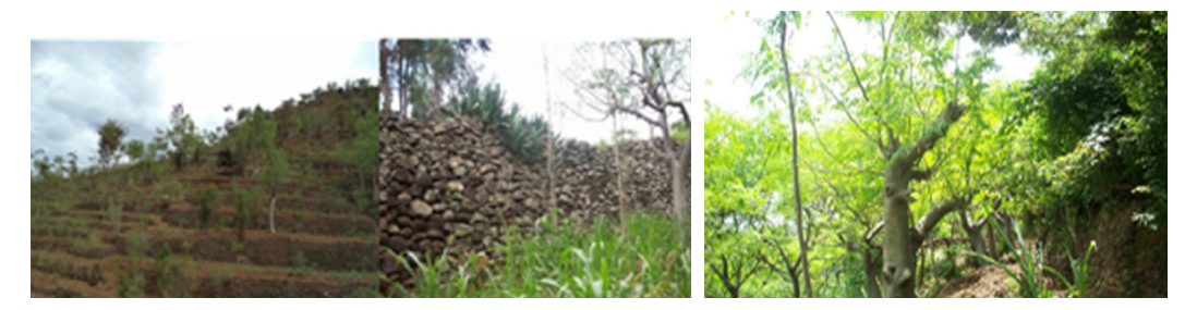
Figure 5: The pictures shows Konso people's ecological knowledge of terracing and agroforestry practices

Observations also indicated that Konso farmers practice local-based agroforestry techniques. According to FGDs that include agriculture development agents, the Konso people are known not just for their terracing practices but also for their effective agroforestry activities. People in Konso recognize that trees give stability to their land, and they support the eroded landscapes by protecting the watershed deep in the ground and facilitating water infiltration. It is repetition. This view of how terracing and agro-ecology have been practiced is vividly illustrated by the following figure: