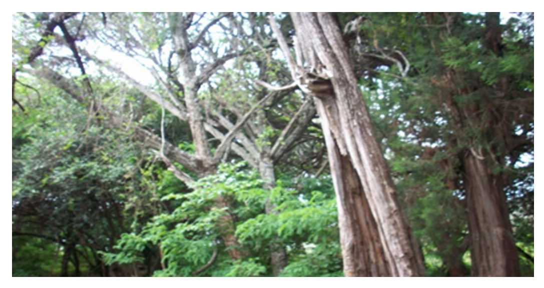
Figure4: The picture shows Konso's sacred forest and/or grove (Picture courtesy: T. Workneh, March 2019)

Figure 3: The picture shows Konso's sacred forest and/or grove (Picture courtesy: T. Workneh, March 2019)