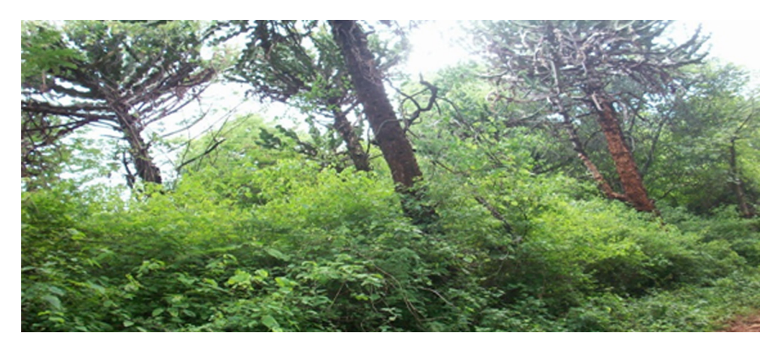
Figure 3: The picture shows Konso's sacred forest and/or grove (Picture courtesy: T. Workneh, March 2019)