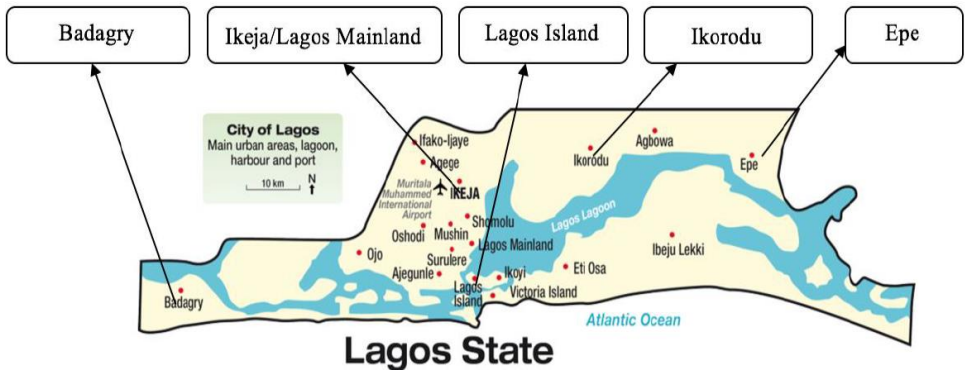
Figure 3a: Map showing the five geographical divisions of Lagos.