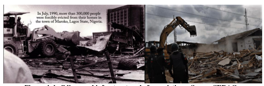
Figure 4: buildings and infrastructure before eviction.

Households were not given the option to add, alter, extend, remodel or modify their original buildings or immediate environment to satisfy a new need. Instead, the displacement was total and comprehensive, with far-reaching implications. For example, Agbola and Jinadu (1997) state that about 41,776 landlords were displaced from Maroko. Of this number, only 2,933 were said to be qualified for relocation by the government of the day. Similarly, the report by the Amnesty International (2006) contends that about 2,000 house-owners were resettled, out of over 10,000. Although there were disparities in the actual number of landlords, there seems to be some agreement that those identified for resettlement stood between 2.000 and 3.000 landlords.