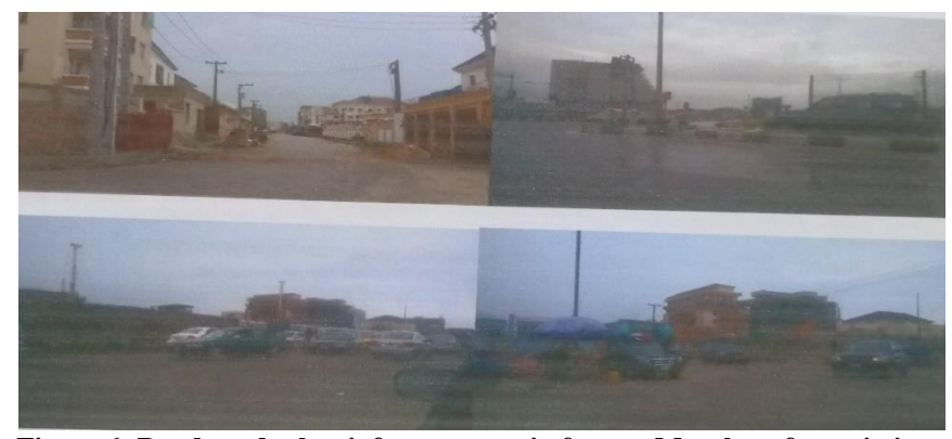
Figure 6: Roads and other infrastructure in former Maroko, after eviction

financial buoyancy. As shown in Figures 5 and 6, the estate is a well-planned residential neighbourhood with essentially three categories of housing types viz: terrace houses, fully detached houses and semi-detached houses. Unlike what obtained in the old Maroko, the new area is served with electricity, good roads, drainages, waste, sewage disposal systems and other amenities