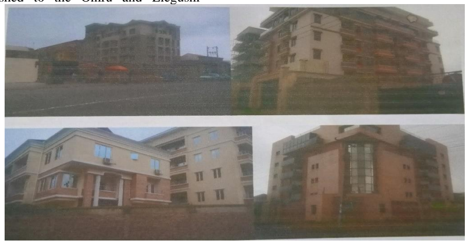
Figure 5: Residential provisions in former Maroko after eviction

Chieftaincy families of Lagos, while the government sold out the rest. Today, Maroko has been transformed into Oniru Private Housing Estate following the victory of Oniru Family over Elegushi Family in an earlier lawsuit.