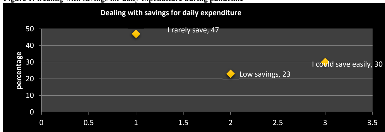
Figure 1: Dealing with savings for daily expenditure during pandemic

The data gathered on the field to find how farm produce were affected by the pandemic was presented in figure 2 as follows; 25% of the respondents revealed that they were able to preserve their farm products, 19% revealed that perishable farm produce was wasted, 56% observed