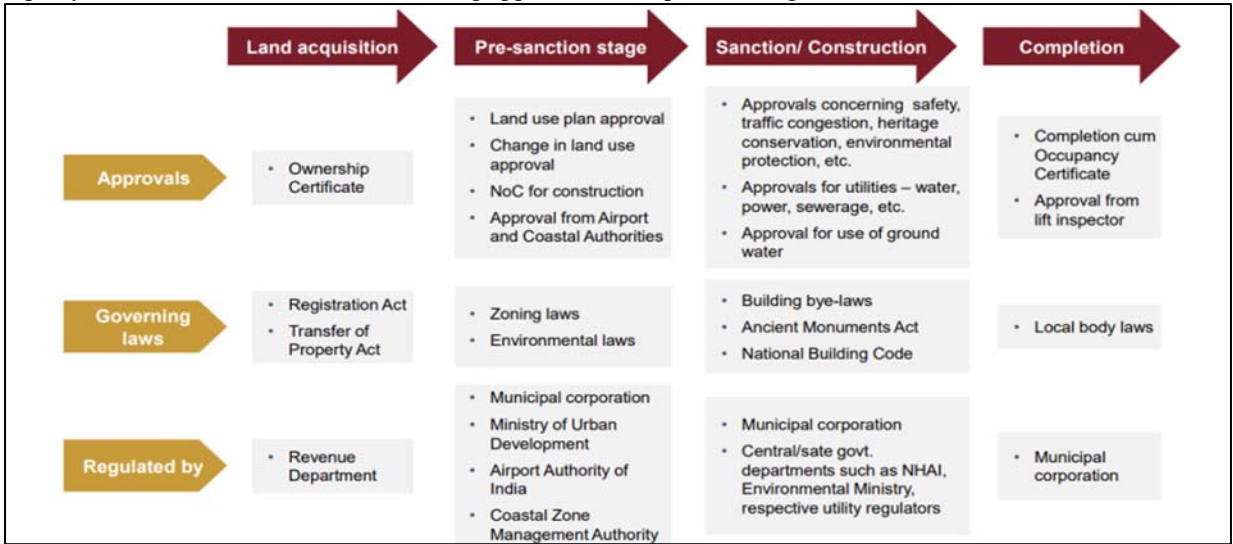
Figure 2: Approvals Housing Corporations Secure in a Project

Equally, the roles of HCs relative to securing approvals are depicted in Figure 2.