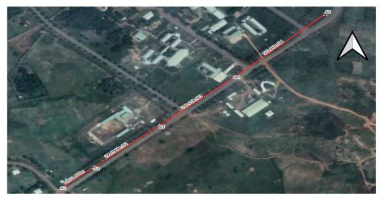
Figure 2: Established Calibration Baseline in FUTMINNA, Gidan-Kwano campus (2023)

between the school workshop and the staff quarters at the main campus of FUTMINNA.