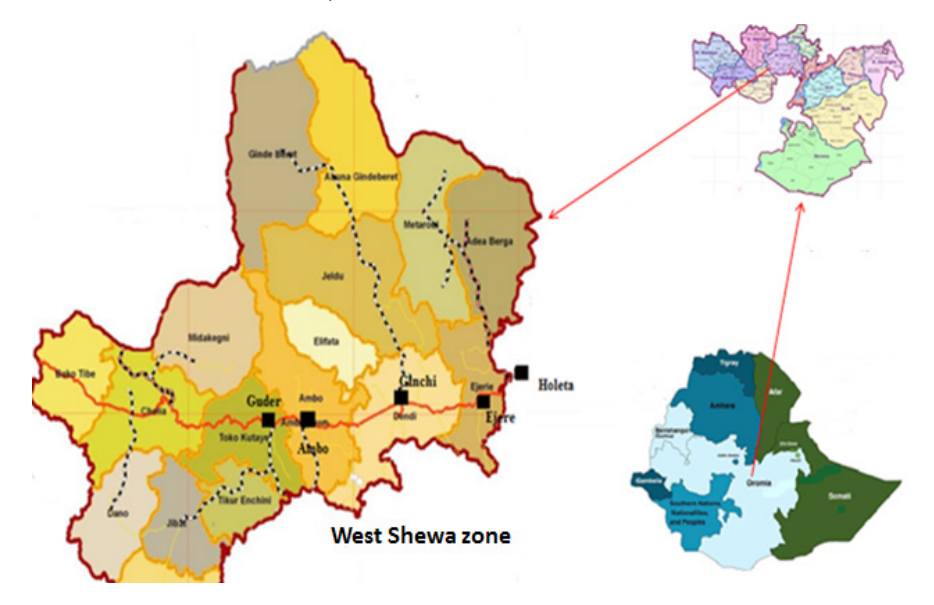
Fig. 1. Map of West Shewa zone showing study towns

The study was conducted from June, 2013 to October, 2014 in West Shewa zone of Oromia Region, in selected towns namely; Holeta, Ejere, Ginch, Ambo and Guder which are located at 40, 50, 90, 114 and 126kms west of Addis Ababa on the way from Addis Ababa to Nekemte, respectively (Fig. 1). Ambo is the administrative center of the Zone. The selected towns lie with the altitude ranges of 2,391 (Holeta) to 2,101 (Guder) m.a.s.l. The mean annual temperature ranges between 22°C (Guder) to 15.9°C (Holeta) and the rain fall ranges between 900-1300mm (Yazachew Etefa and Kasahun Dibaba, 2011).