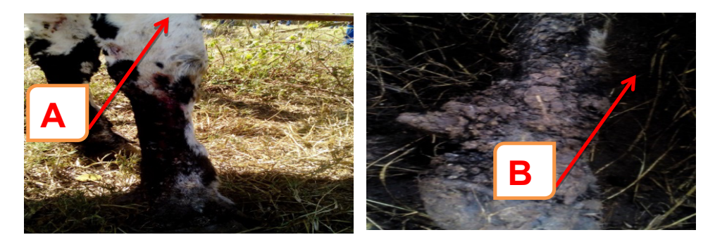
Fig 3. Forelimb of dermatophilosis affected heifers showing erythema (A) and characteristic hyperkeratosis (B)