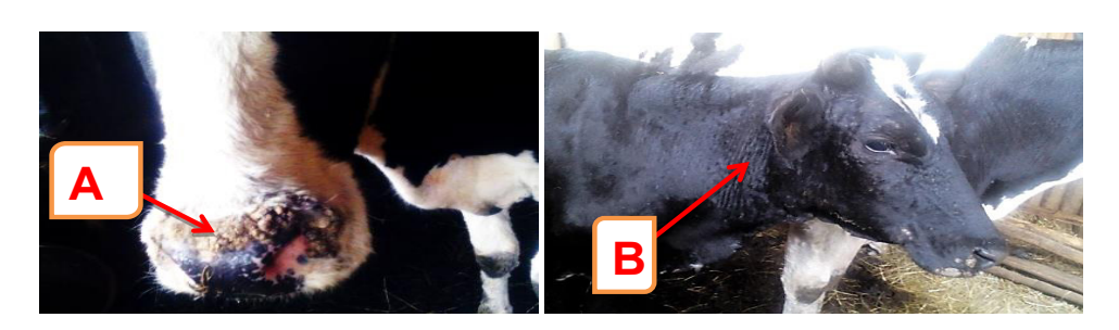
Fig 1. Dermatophilosis lesion on the head region/muzzle (A) and neck (B) of 2year old heifers

Edilu Jorga Sarba and Bizunesh Mideksa Borena