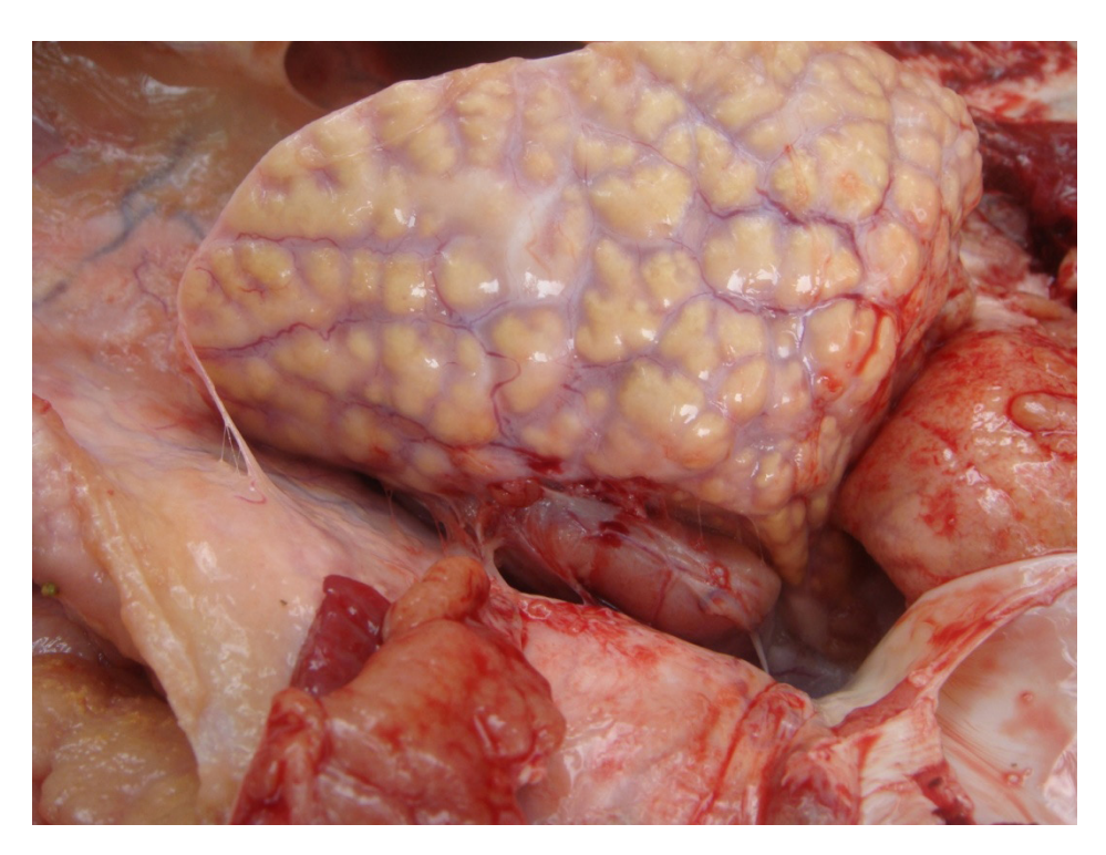
Figure 2. Extensively affected lung tissues with diffuse pus and tubercle lesions as well as adhesion to the pleural cavity due to fibrinous inflammation

When the lung was dissected very thick pus and the tubercles were observed. The pleural cavity was full of pale fibrous tissue capsules (tubercles) (Figure 3). The bone marrow was also found full of pus. In the present case, pulmonary involvement was highly pronounced (that is, the whole lung tissue was affected significantly). In addition, granulomatous lesions were found widely spread in the peritoneum, mesentery, liver, kidneys, intestines and mesenteric lymph nodes.