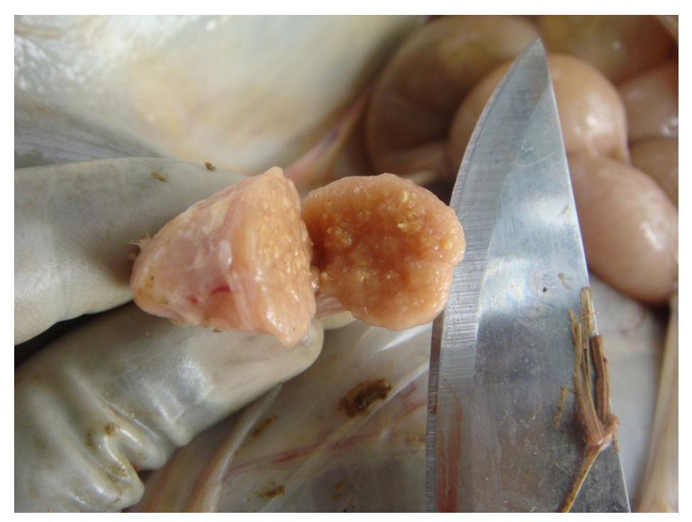
Figure 1. An incised mediatinal lymph node showing tubercle with calcified caseous exudates

Postmortem examination of the dairy cow was conducted and showed tuberculous lesions in the lung, liver, mediastinal lymphnodes, mesenteric lymphnodes, pleural cavity, reproductive tract, lymphnodes of the head and bone marrow. Disseminated miliary TB was noted as depicted in Figure 1.