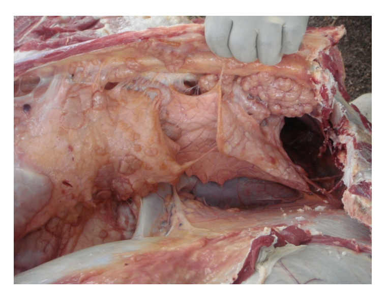
Figure 3. Pleural cavity full of fibrous tissue capsules (tubercles) that led to adhesion with the lung tissue and other associated structures.

Pus from the intestines and smear from the granulomatous lesions were collected and examined for detection of acid fast bacilli. Acid-fast bacteria typical of mycobacteria were detected in the smear samples. Tissue samples from tuberculosis lesions from different tissues were processed, sectioned and stained following standard histological technique (Bancroft et al. , 1988). Microscopic examination of hematoxylin and eosin stained slides revealed granulomatous inflammation, with epitheloid cells surrounding the central necrotic area, lymphocyte infiltration, giant (multinucleated) cells at periphery and fibrous encapsulation (Figures 4 and 5).