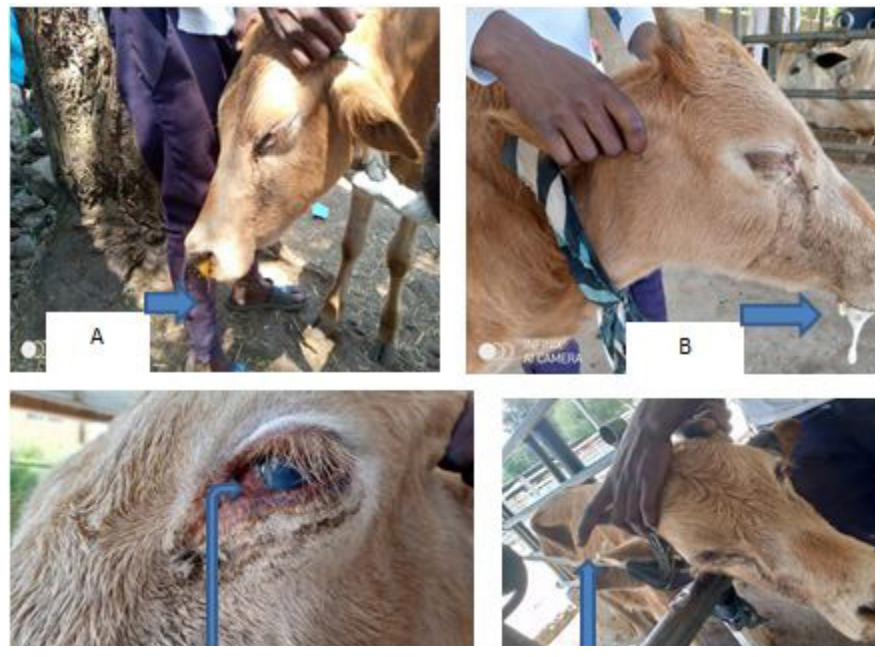
Figure 1. Clinical evidence of the case: (A); Yellowish mucoid nasal discharge (B); Foamy salivation (C); Corneal opacity (D); Emaciation with prominent ribs and pelvic bone

and fed with sheep, horses, and donkeys. Body vital parameters revealed that the bull was febrile with 41.4 °C, 40 breaths per minute, and 48 beats per minute of temperature, respiratory rate, and heart rate, respectively. The bull was highly emaciated, with bilateral yellowish mucopurulent naso-ocular discharge, frequent blinking of the eyes, bilateral corneal opacity, salivation, foamy mouth, and prescapular and prefemoral lymph node enlargement (Figure 1). The team of veterinarians went to the village where the animals lived and discovered that the bull and other animals (a donkey, a horse, and sheep) shared the same house and communal grazing land. Based on the clinical presentations, viral diseases like infectious bovine rhinotracheitis (IBR), malignant catarrhal fever (MCF), rickettsial infections like ehrlichiosis, and other diseases with related signs were suspected.