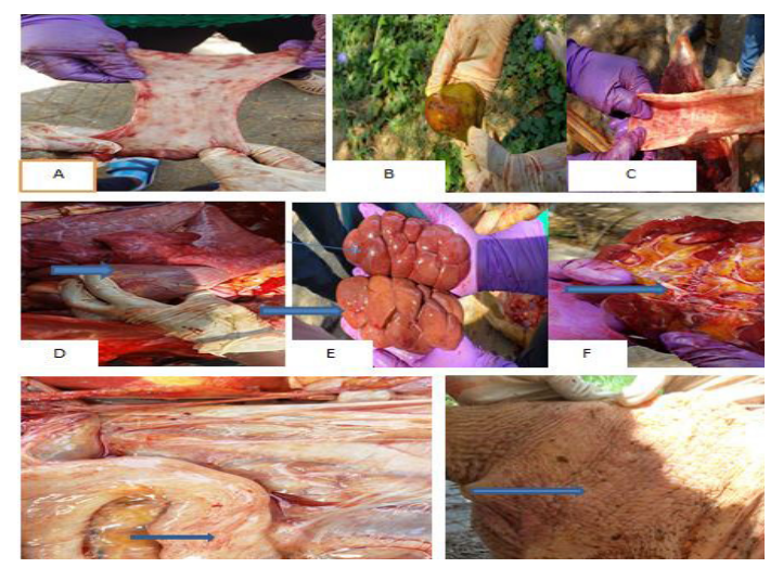
Figure 2. Post-mortem findings of the case: (A); Hyperemic esophagus (B); Eroded lesion on gall bladder (C); Hemorrhage on the trachea and diphtheritic mucus membrane (D); Engorged heart (E); Infarct and white foci on the kidney (F); Fatty degeneration (G); Hemorrhage on intestine and (H); ulcerated lesions on abomasum.

Immediately after the bull died, the cadaver was opened for post-mortem investigation. The trachea, esophagus, lymph nodes, lung, liver, kidneys, gall bladder, and gastrointestinal tract were thoroughly investigated and sampled. The gross postmortem findings were hemorrhages in various organs, including the esophagus, trachea, and small and large intestines. In the kidney, white foci, enlargement, and fatty degeneration were noted. In addition, ulcerated lesions on the abomasum, enlargement, and vascularization of the gall bladder were seen, as indicated in Figure 2 below.