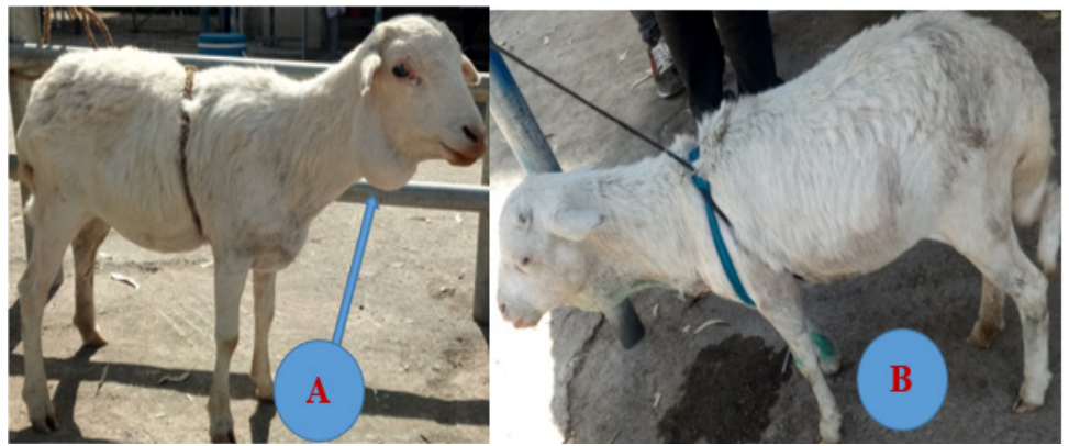
Figure 1. Picture of the sheep affected by caseous lymphadenitis ( A ) and after therapy ( B ).

During clinical examination, the sheep displayed symptoms such as loss of appetite, coughing, general ill health, purulent nasal discharge, fever, and increased respiratory rate. Additionally, there was enlargement of subcutaneous tissues and lymph nodes around the neck region, and a hot, fluctuating, sickleshaped, and enlarged swelling (Figure 1) was observed. Aspiration of this swollen mass with a sterile 20-gauge needle and syringe revealed thick, pale green, watery to cheesy pus, which confirmed the presence of a pus-filled cyst around the neck region. The EDDIE App-based diagnosis revealed the case as CLA and its treatment options. Therefore, based on the history of a wound, characteristic clinical signs, and EDDIE App-based diagnosis result, the case was tentatively diagnosed as CLA, which is differentially diagnosed with localized tumor (lymphoma), abscess oedema, and haematoma.