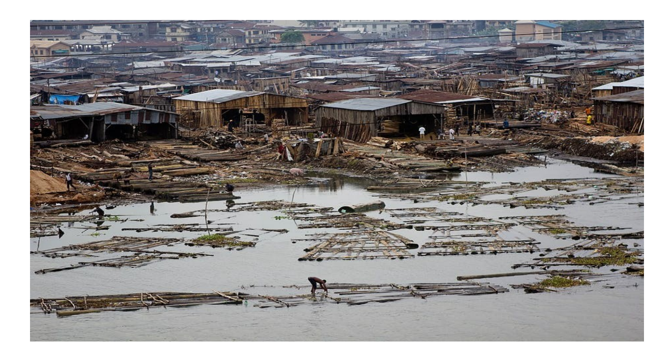
Plate 2: People living in shanty houses in Lagos