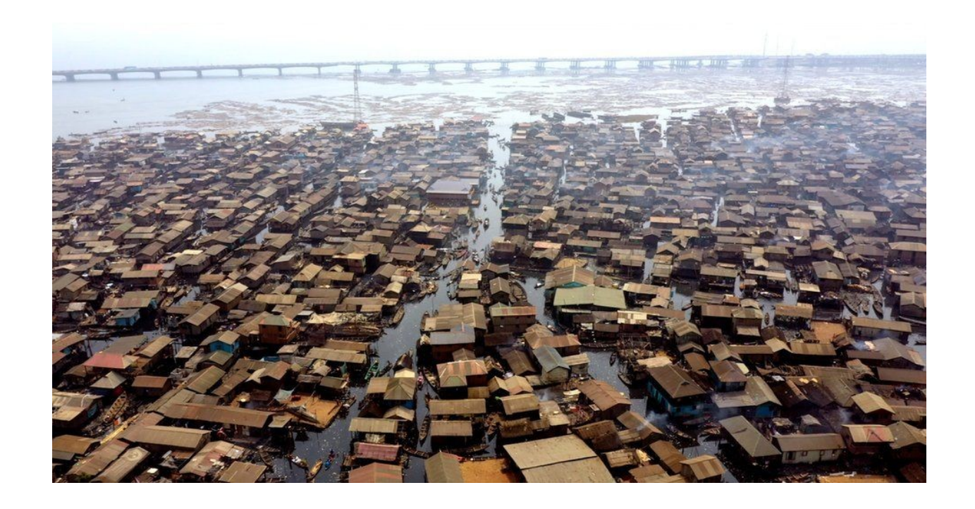
Plate 1: People living on 'floating' houses in Lagos

The urban poor has an urgent need for shelter, hence all they crave for is somewhere to lay their head. There is high value of land in the core centres of the urban cities is another factor determining the decision to move to the edge of the cities for solution to the urgent need for housing.