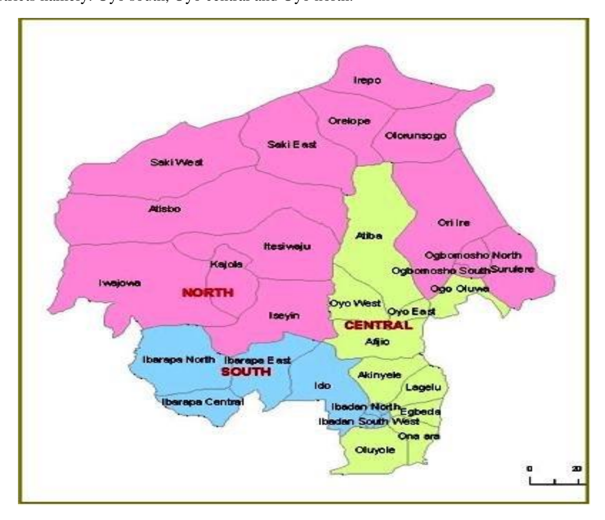
Fig 1: Map of Oyo state showing the study area

Oyo State is bounded in the south by Ogun State, in the north by Kwara State, in the west by the Republic of Benin, and in the east by Osun State. The state covers an area ranging from swamp forests to western uplands. In between are rain forests, and deciduous forest/savannah mosaic. The rainfall pattern is bimodal with the peaks in June, early July and September, while November to February is characterized by harmattan brought about by the effect of the north-easterly trade winds from Sahara region. Agricultural sector forms the base of the overall development thrusts of the state, with farming as the main occupation of the people in the area. Crops usually grown include cocoa, oil-palm, maize, yam, cassava, cocoyam, melon, cowpea, and vegetables under mixed cropping practices. Agricultural activities utilize more than 65% of the total land area of the state. Lowland Rainforest account for about 6%, while trees/woodlands/shrubs covers about 22% of the total land area of the state. Most people in the state depend on fuel wood as energy source for cooking while, poles are used for supporting electricity cables, and sawn wood are utilized for production of furniture, pulp, paper and building houses. Oyo state is divided into three senatorial districts namely: Oyo south, Oyo central and Oyo north.