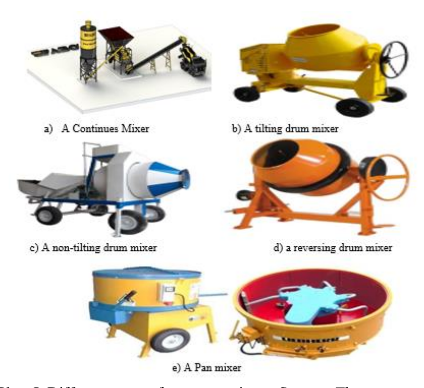
Plate I: Different types of concrete mixers.

Shwe-Sin (2018) defined transit mixer as a piece of equipment that is used for transporting concrete or ready mix material from a concrete plant directly to the site. They can be charged with dry materials and water, with the mixing occurring during transport. They can also be loaded from a central mix plant with this process the material has already been mixed prior to loading (Shwe-Sin 2018).