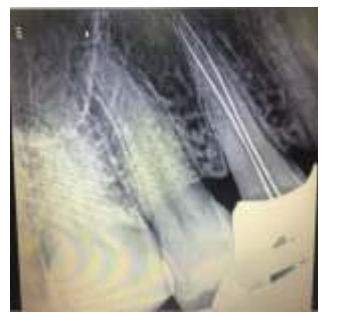
Vertucci Type IV canal configuration (Maxillary 1<sup>st</sup> Premolar)