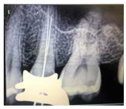
Vertucci Type V canal configuration (Maxillary 2<sup>nd</sup> Premolar Figure 3: Canal configurations observed in the studied maxillary premolars