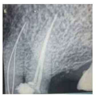
Vertucci Type II canal configuration (Maxillary 1<sup>st</sup> and 2<sup>nd</sup> Premolar)