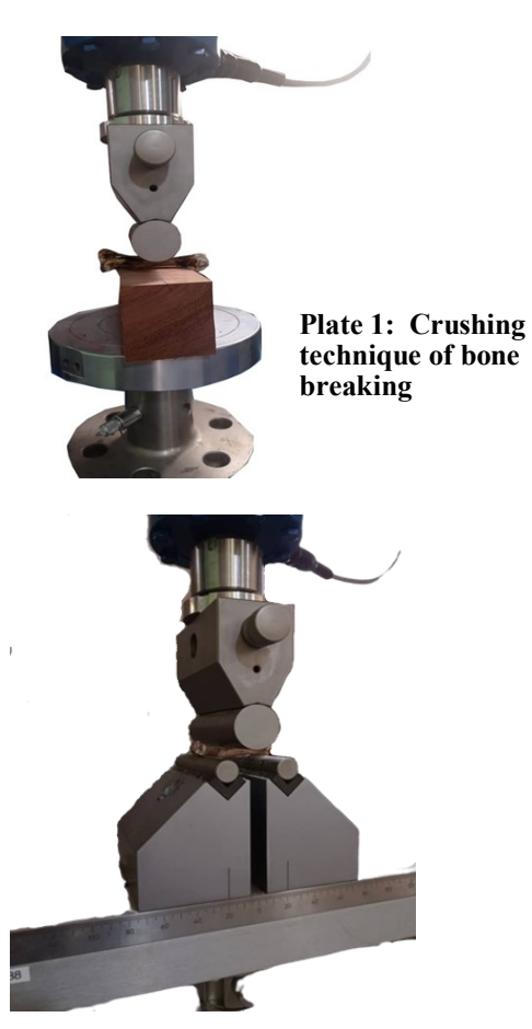
Plate 2. Three-point bending technique of bone breaking

Data for experiments 1, 2, and 3 were analyzed using the General Linear Models (GLM) procedure in Minitab 21.1. Tukey's mean separation test was used to make comparisons between treatment means. In experiment 4, the data means were compared using an independent t -test. All statistical analyses were considered significantly different at p < 0.05.