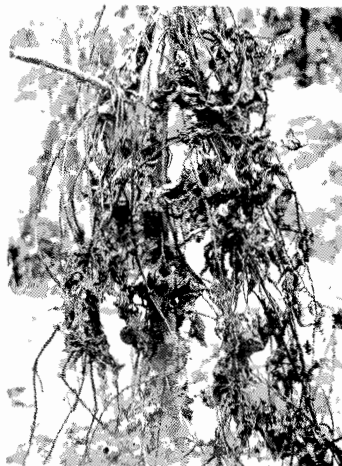
Fig. 1. Water yam plant sprayed with water (control).

The percentage reduction in disease severity