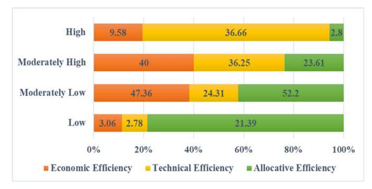
Figure 2: Percentage distribution of farmers according to their technical efficiency, allocative efficiency, and economic efficiency estimates

As illustrated in Figure 2, the percentage distribution shows that the majority (i.e., about 72.91 %) of the farmers exhibited a moderately high to a high level of technical efficiency profile, with few of them (2.78 %) showing a low level of technical efficiency profile at the farm level. From this it can be inferred that majority of the farmers when given the needed technical training can significantly be improved their farm-level performance given the existing technology. We further observed from the results that when it comes to allocative efficiency, the majority (i.e., about 75.81 %) of the farmers exhibited a moderately low to moderately high level of allocative efficiency profile. In addition, we observed that about similar situation happened for economic efficiency, where about 87.37 per cent of the farmers exhibited a moderately low to a moderatelyhigh level of farm-level economic efficiency profile. This means, there is a need for urgent technical and farm-management economic training for cocoa farmers to help improve their technological and economic performance in production. The significant variations in efficiency distribution among farmers as observed in Figure 2 tend to collaborate with previous study findings on the distribution of technical, allocative, and economic efficiencies among farmers in cocoa production in Ghana (Aneani et al., 2011; Onumah et al., 2013; Danso-Abbeam & Baiyegunhi, 2020).